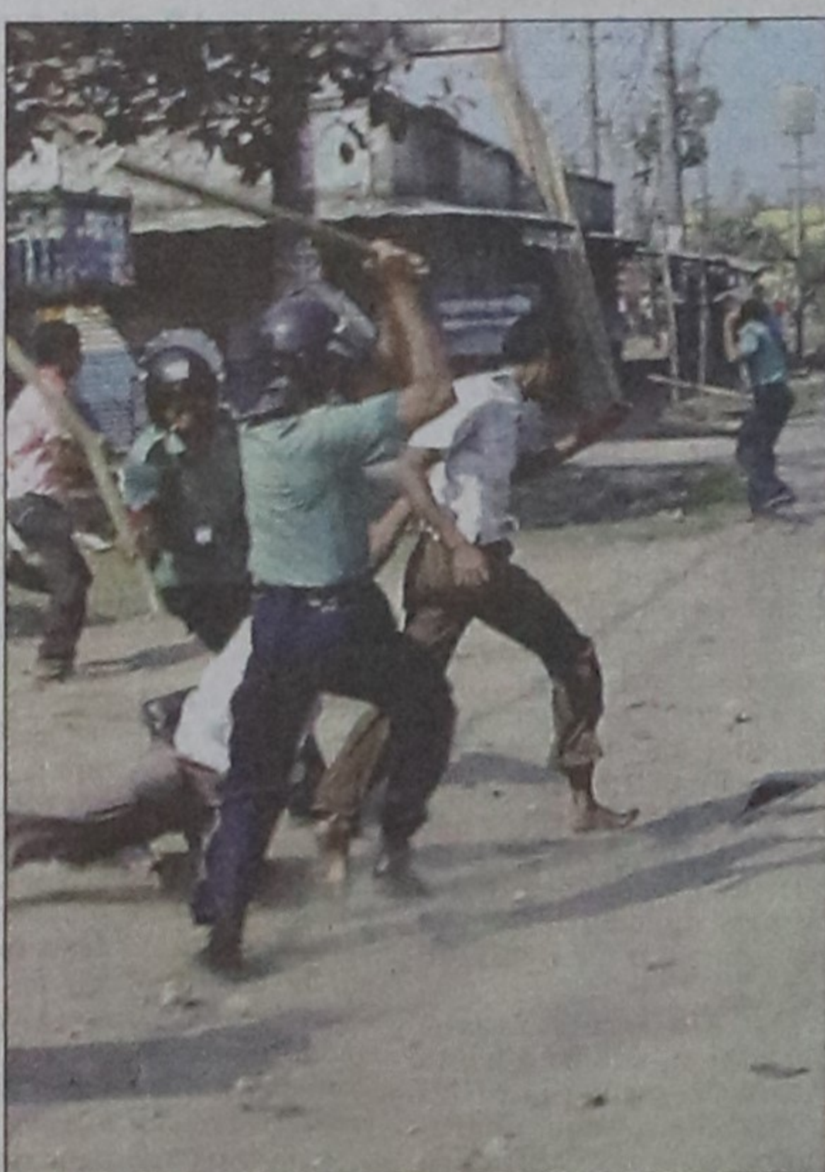
Students of Khulna Polytechnic College yesterday clash with police as the law enforcers tried to resist the unruly students who were protesting against reforms in their examination system. Policemen charge truncheons to disperse the demonstrating students.

STAFF CORRESPONDENT, Khulna Clashes between police and students of Khulna Polytechnic Institute (KPI) at Khalishpur left at least 30 people, including three policemen, injured on the campus yesterday. Police swung into action as over 300 students of the institute went on rampage on the campus at about 10:30am demanding cancellation of new examination rules of the Technical Education Board, which say that no student is entitled to appear at the 'referred examination' more than once. Police lobbed at least 50 teargas shells and charged batons on the students indiscriminately while agitated students hurled stones and bricks at the policemen during the four-hour clash, leaving 30 injured. Vehicular movement on Khulna-Jessore highway remained disrupted for about three hours as the students put up barricades at several points. The agitated students damaged furniture, doors and windows of the academic and administrative buildings, many roadside shops SEE PAGE 15 COL 3