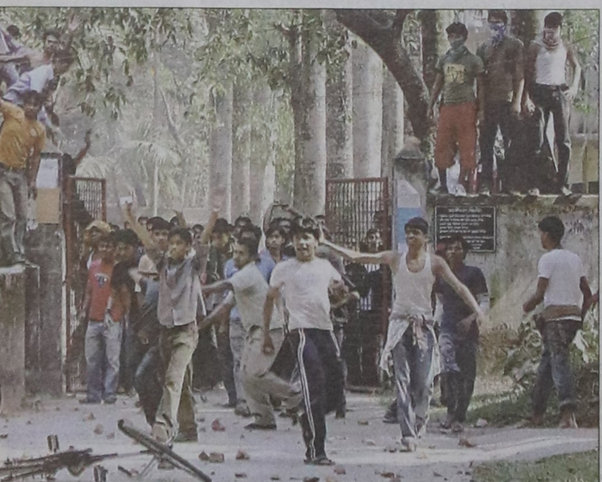
Students of Khulna Polytechnic College yesterday clash with police as the law enforcers tried to resist the unruly students who were protesting against reforms in their examination system. Policemen charge truncheons to disperse the demonstrating students.