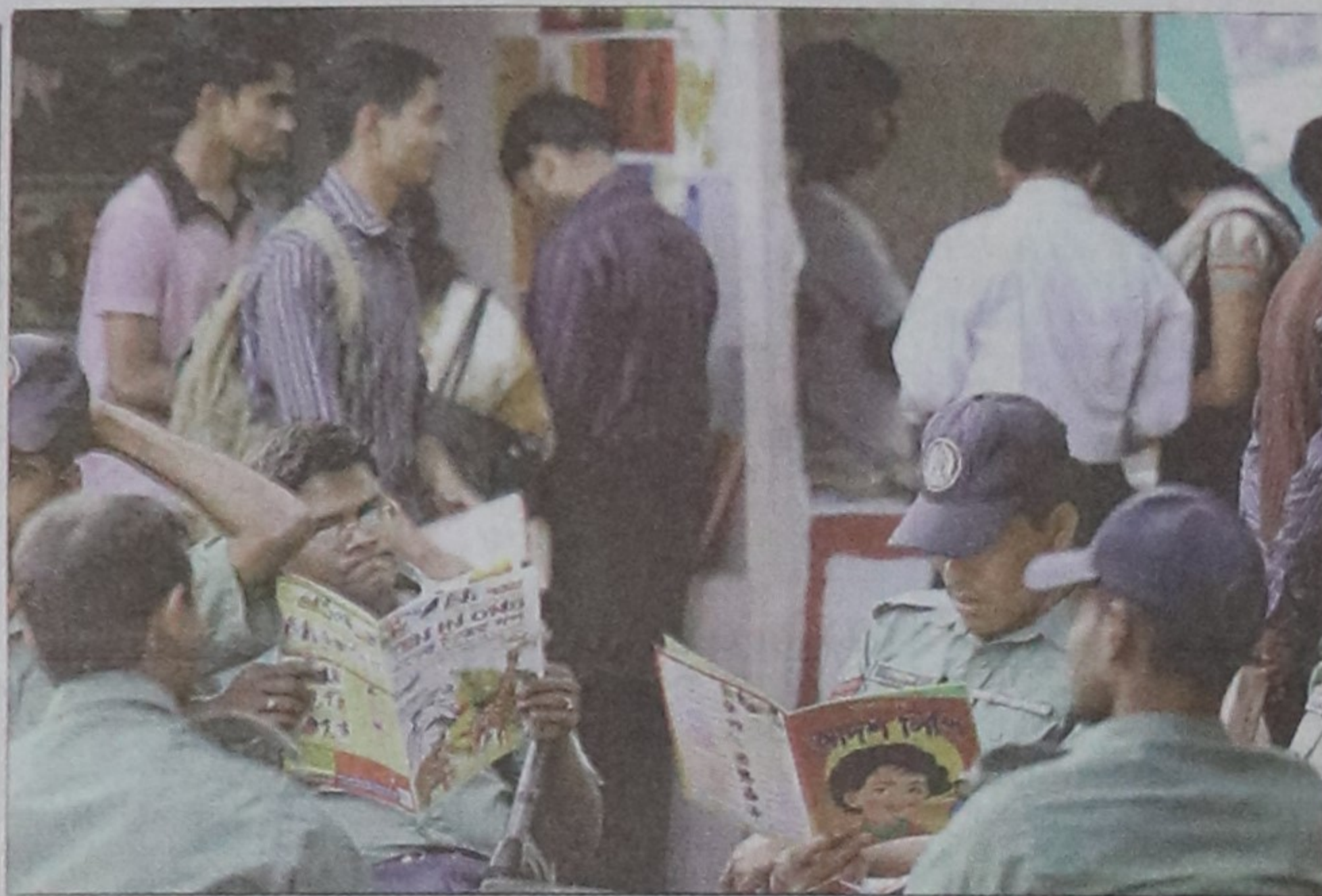
Policemen deployed at the Amar Ekushey Boi Mela take a break from duty yesterday and thumb through some children's books.