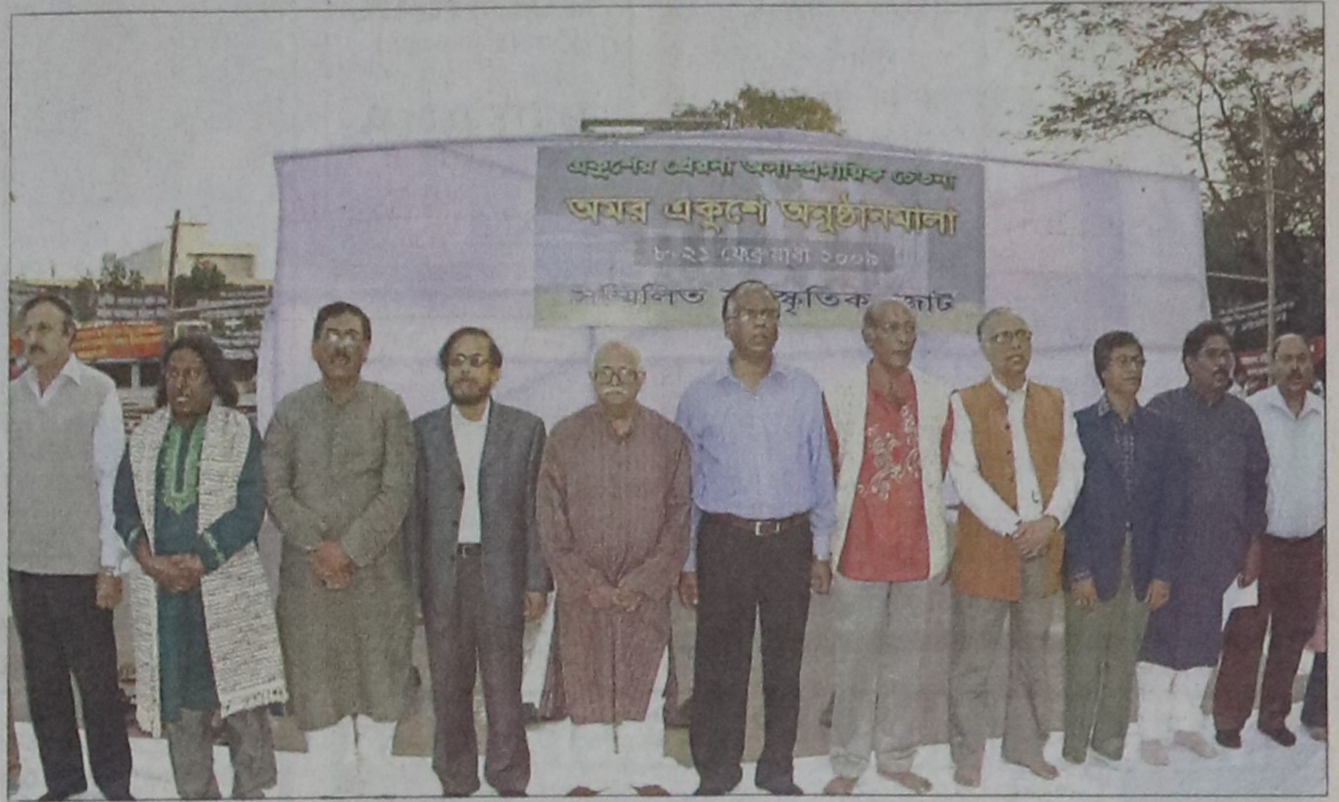
Guests observe one minute's silence at the inaugural function of the Amar Ekushey programmes at Central Shaheed Minar in the city yesterday. Sammilita Sangskritik Jote organised the event.

He wound up his tour through a press conference prior to his departure for India yesterday afternoon.