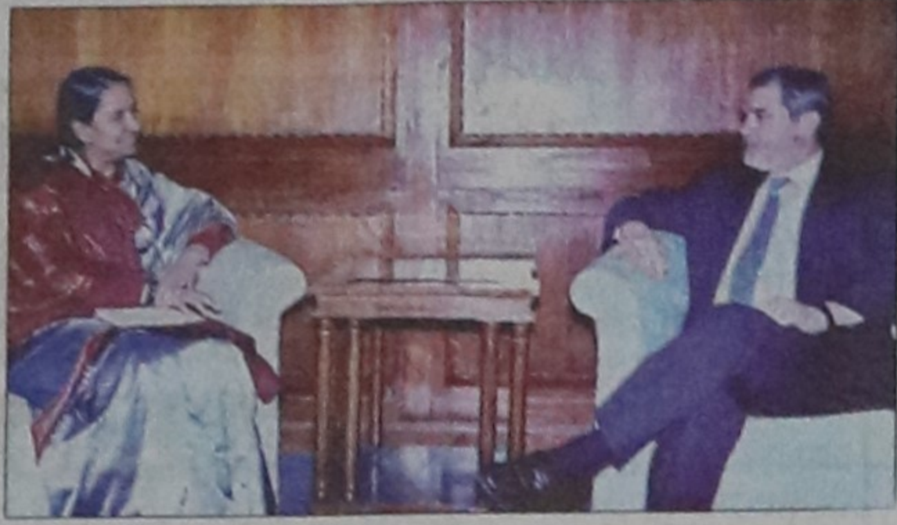
US Assistant Secretary of State for South Asia Richard A Boucher calls on Foreign Minister Dr Dipu Moni at her office in the city yesterday.

excited about the framework agreement," he added.