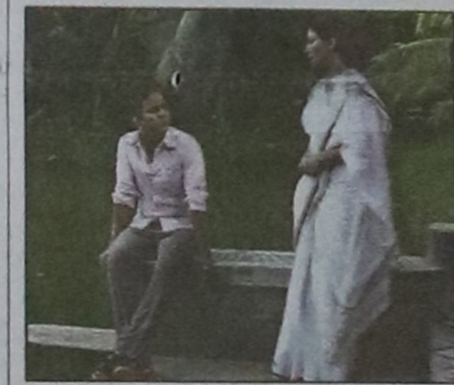
A scene from the telefilm