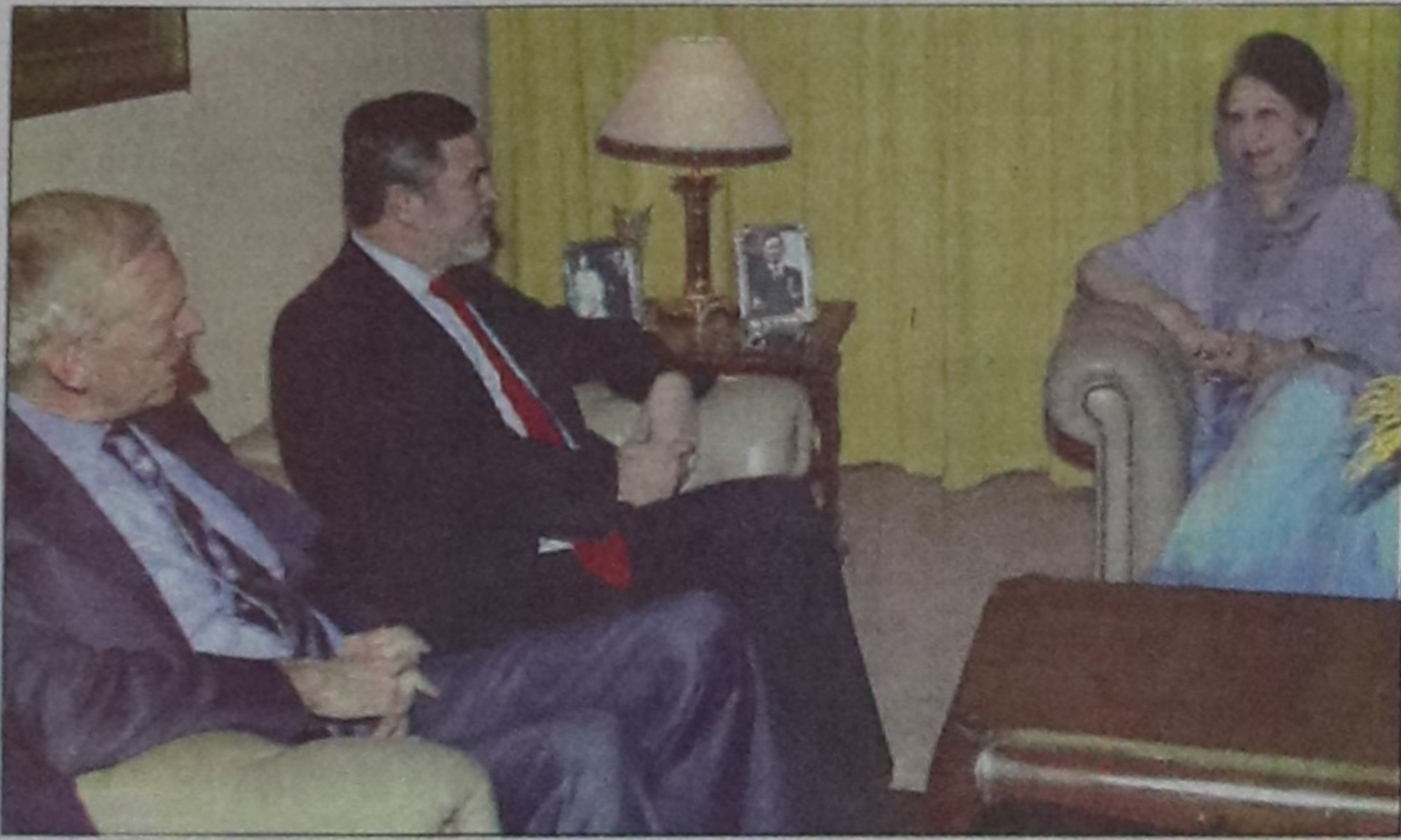
US Assistant Secretary of State for South and Central Asian Affairs Richard A Boucher calls on Leader of the Opposition in Parliament Khaleda Zia at her Gulshan office in the city yesterday. (Story on Page 1)