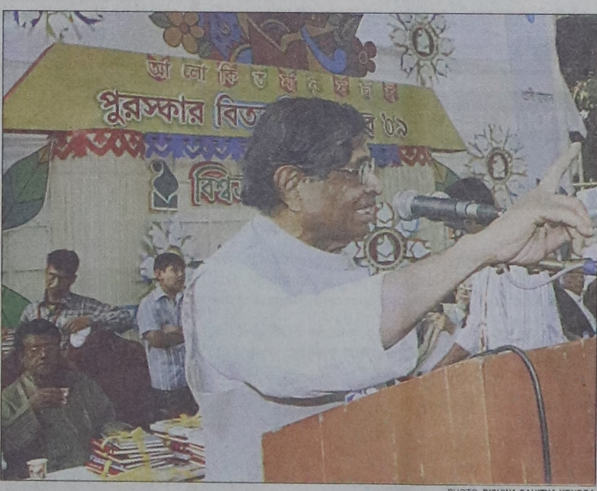
Prof Abdullah Abu Sayeed speaks at the prize giving ceremony of the book-reading programme of Bishwa Sahitya Kendra at Ramna Batamul of Ramna Park in the city yesterday.