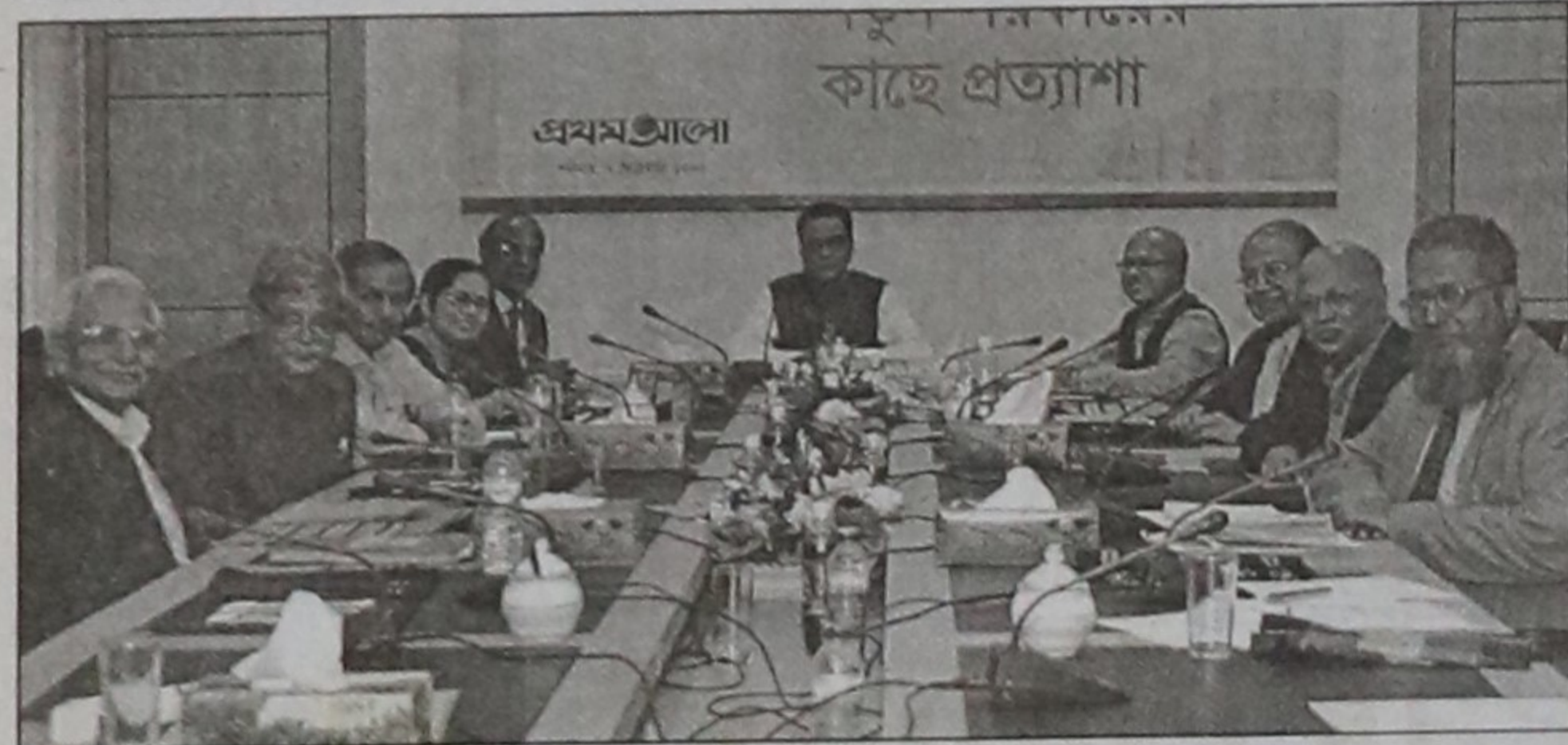
Local Government and Rural Development (LGRD) Minister Syed Ashrafur Islam speaks at a roundtable styled "Expectations to the New Government" at the Prothom Alo conference room in the city yesterday. (Story on Page 16)

Zhao said China was working very hard to strike a balance in its ties with South Asian neighbours particularly in view of the strains in ties between New Delhi and Islamabad.