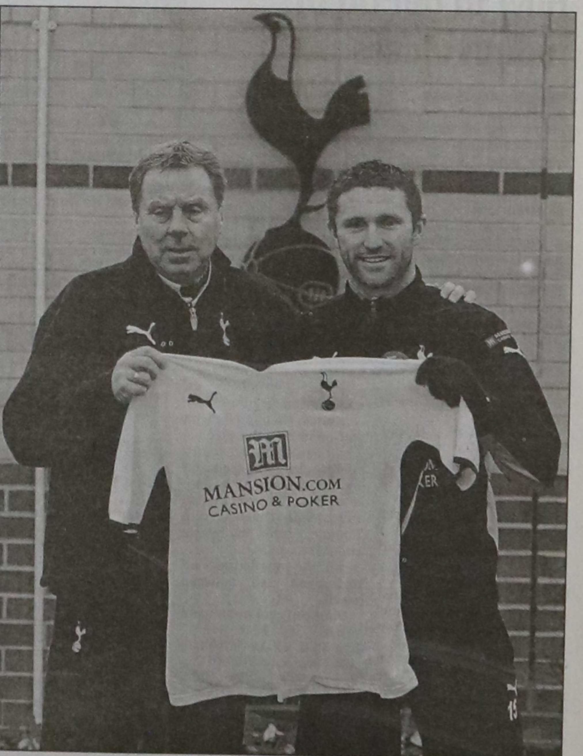
Tottenham manager Harry Redknapp (L) poses with new signing Robbie Keane outside the Spurs Lodge training ground in east London on Friday.

Elsewhere, third-placed Sevilla host a freefalling Real Betis on Saturday in a hotly-contested derby.