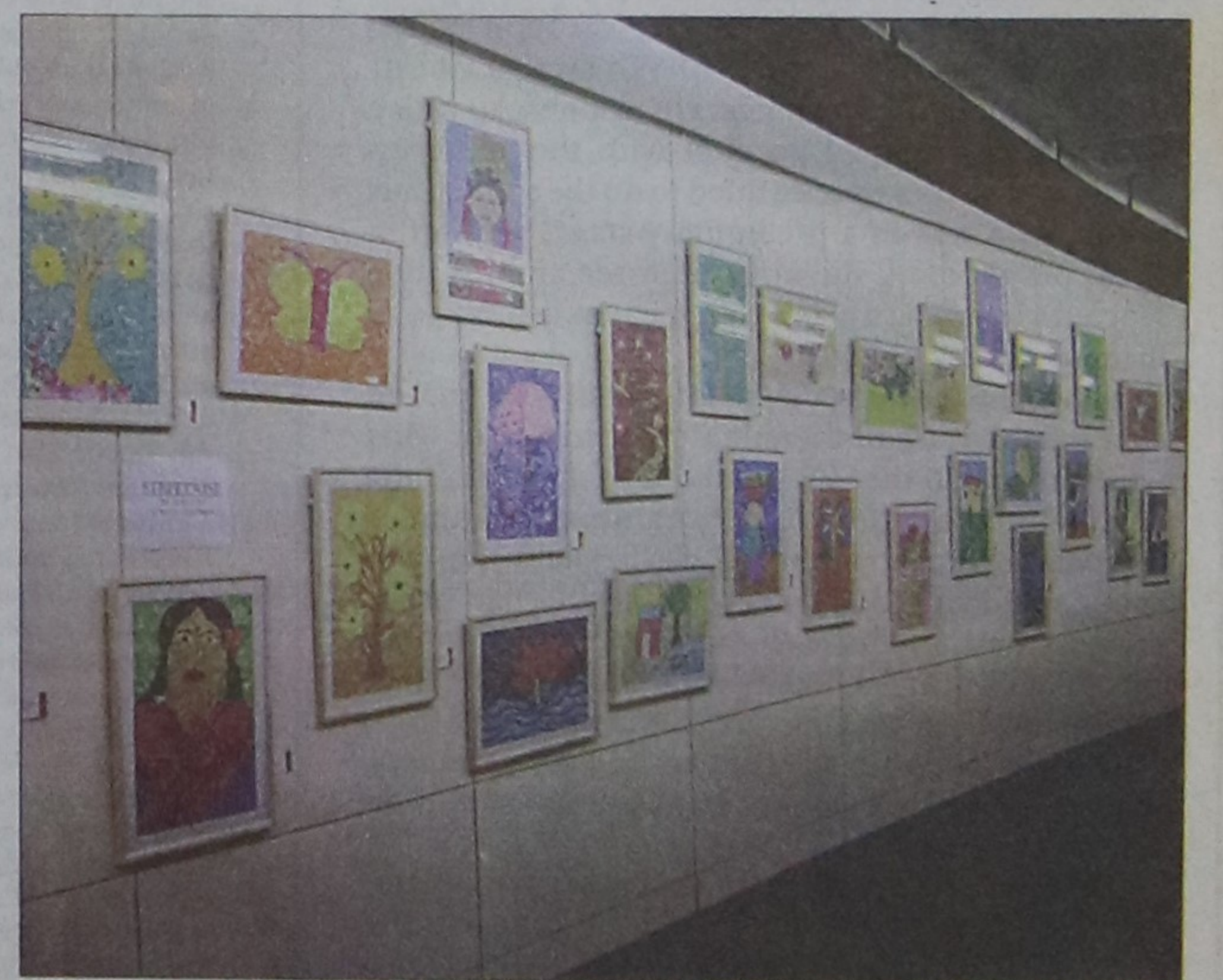
Streetwise Art Exhibition, being held at Bay's Galleria, features artworks by children living on the streets of Dhaka.