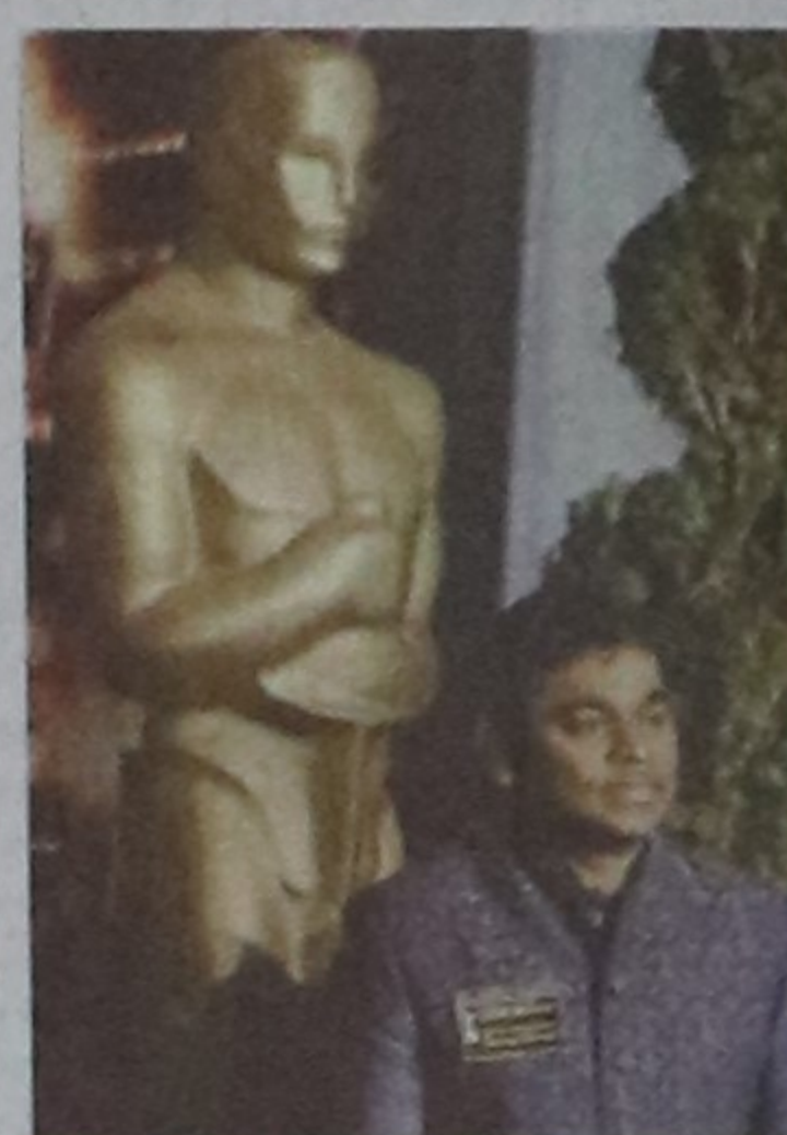
A.R. Rahman arrives at the Academy Award luncheon in Beverly Hills, California on February 2, 2009.

Rahman says the film is consistent with his humanitarian goals. An honorary U.N. ambassador, he set up the A.R. Rahman Foundation to support educational programmes for underprivileged children across India. He has also founded a conservatory in his home city of Chennai to prepare youngsters for careers in music.