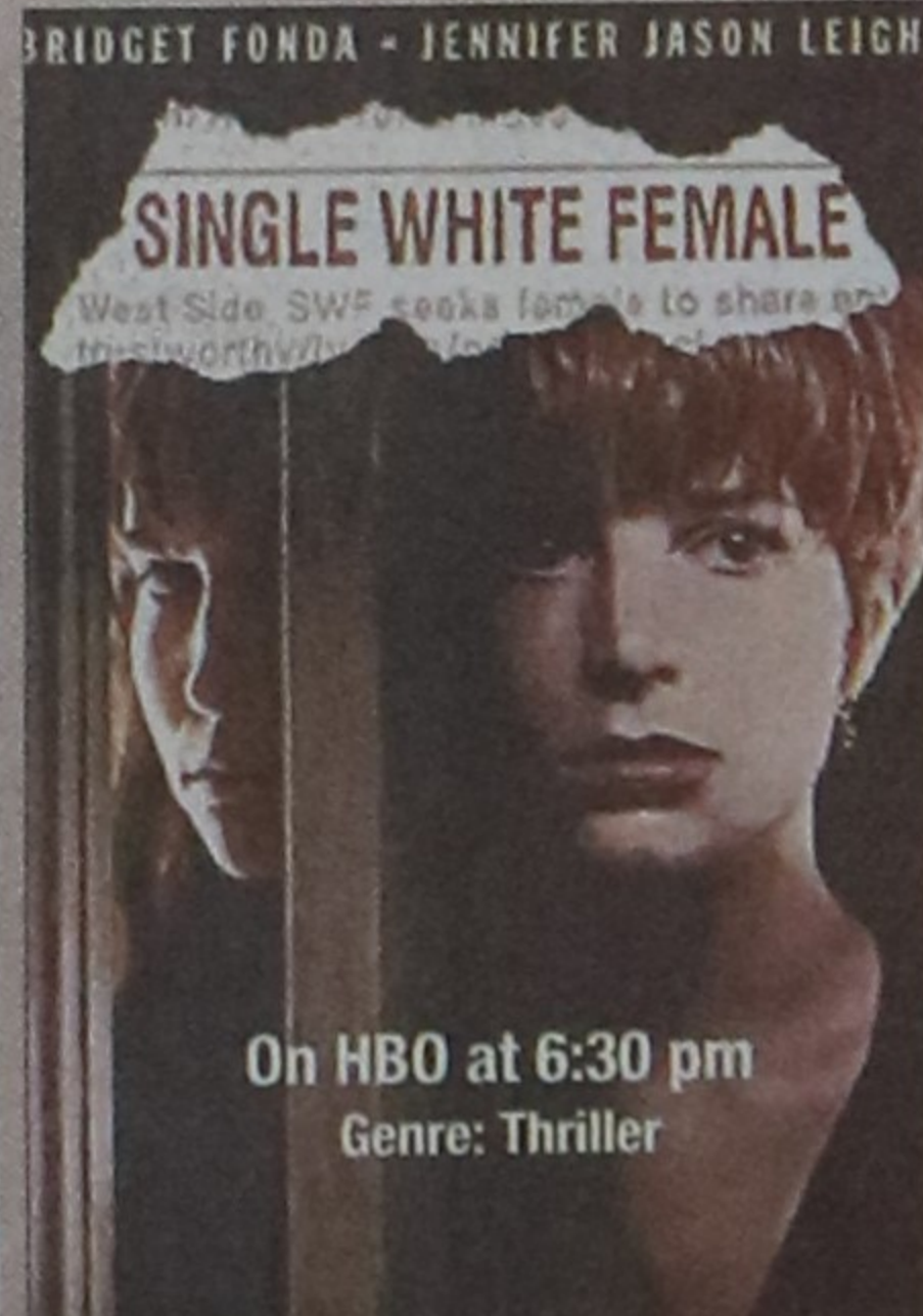
On HBO at 6:30 pm Genre: Thriller

abc radio 89.2 FM 06:00 Bhorer Janjati 06:30 Mukhorito Jiboney 12:00 Darun Dupurey 03:00 Dararito Boleley 05:00 Shoncholar 07:00 Shair-e-Miya 09:00 Raat-er Akash 11:00 Jay Golper Shash Nei Radio Forth 88.9 FM 08:00am Addabazi 12:00pm Boler Poko 02:00pm Forth Unlimited 06:00pm Bumper to Bumper 10:00pm Club Forth Radio Today 89.6 FM 07:15am Good Morning Dhaka 11:00am Mani Unlimited 01:00pm Saturday World Music 04:00pm Top of The Week 08:00pm Raat Vor Gan 11:00pm Back to Back 2:00 am