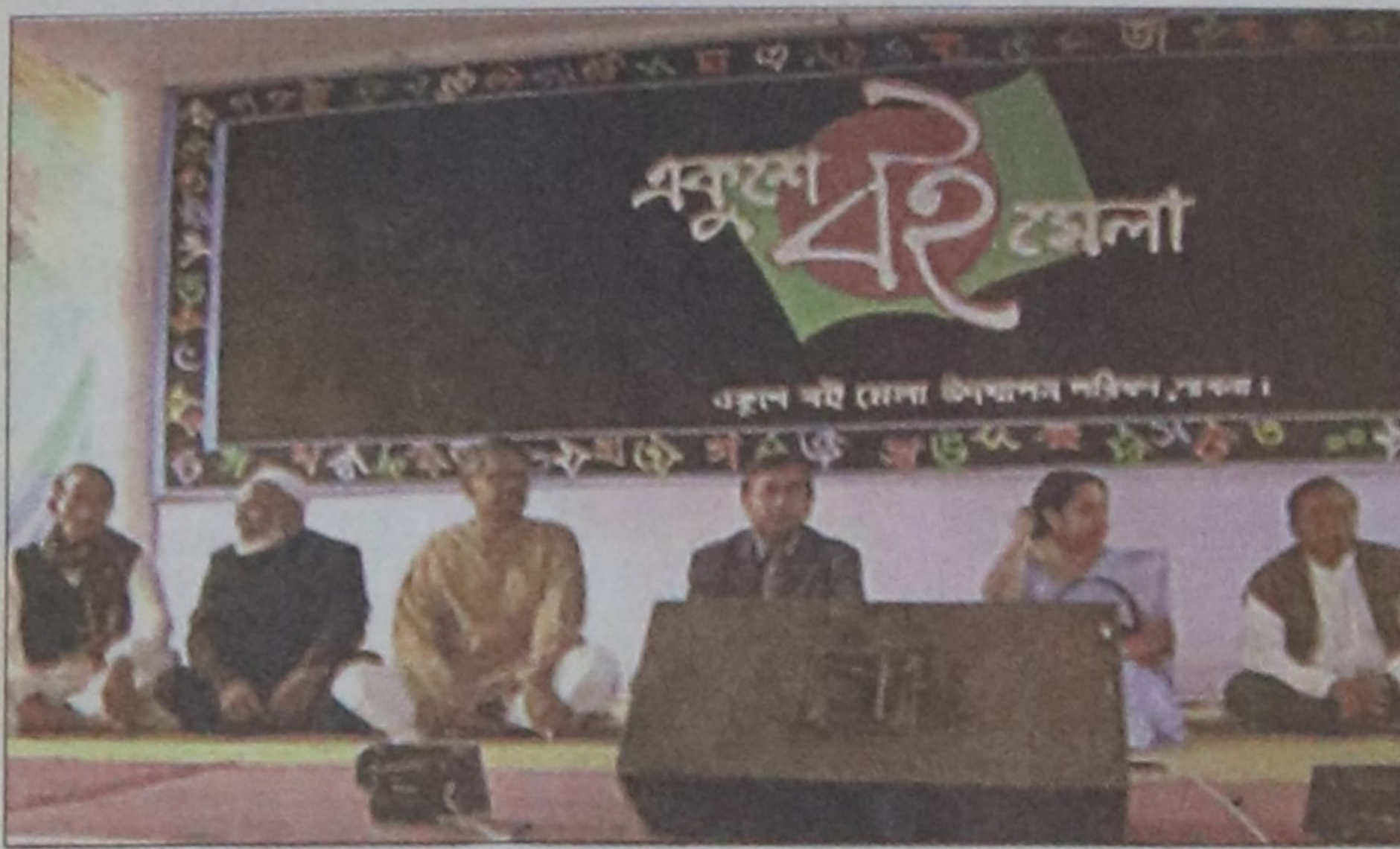
Guests at the inaugural of the book fair last Thursday.