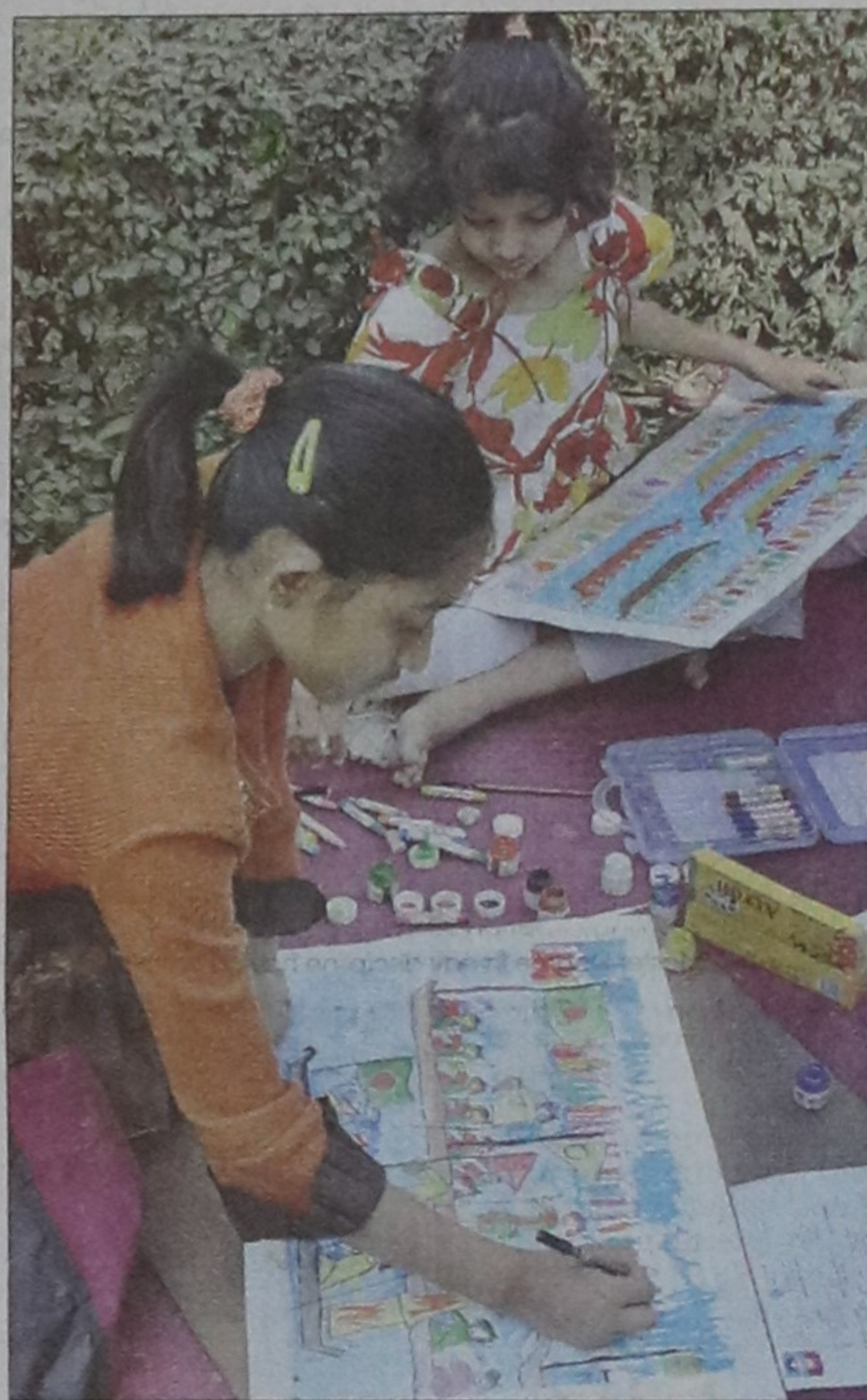
Children engrossed in drawing pictures on the Bangla Academy premises in the city yesterday. The academy organised the drawing competition for children on the occasion of Amar Ekushey.