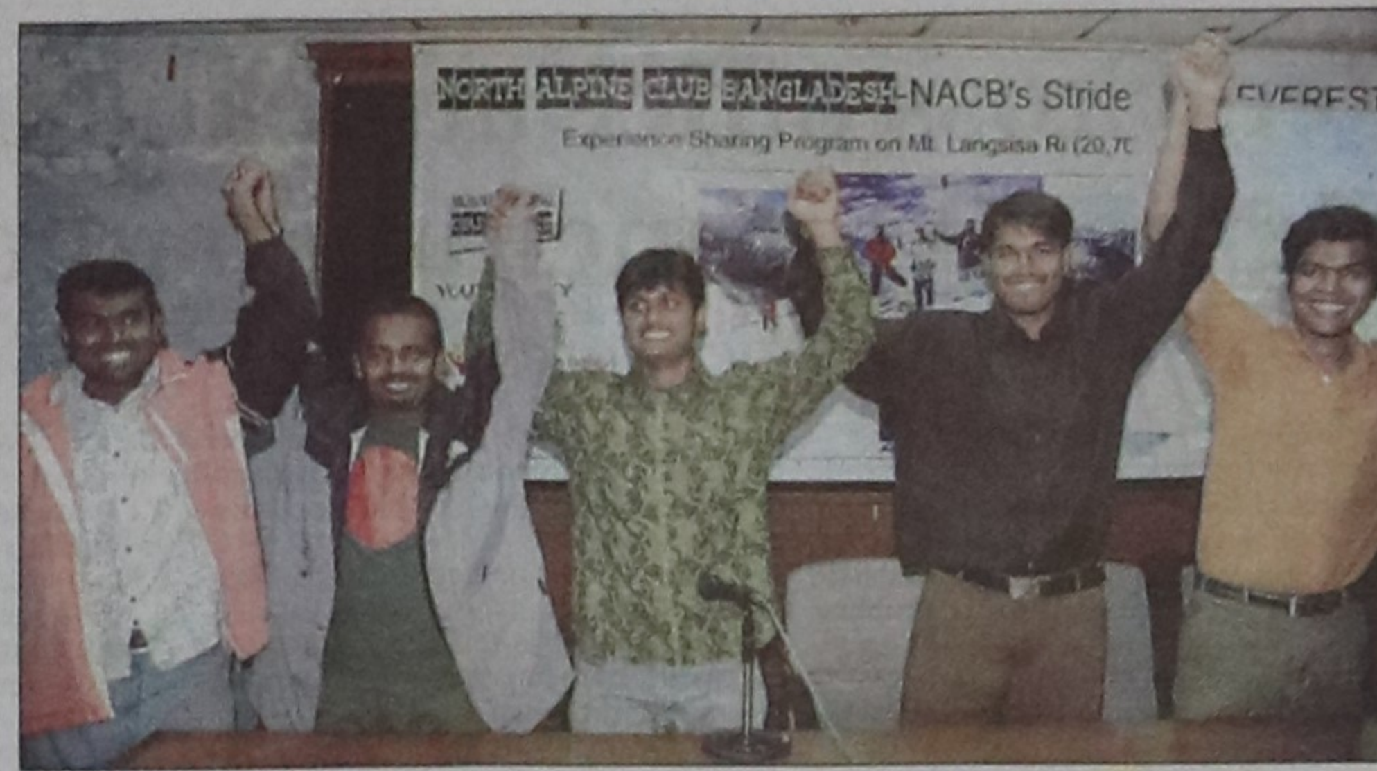
Mountaineers of North Alpine Club Bangladesh express their jubilation by raising their hands at an experience sharing meeting at the National Press Club in the city yesterday. They conquered Langsisa Ri peak in Nepal on December 1 last year. They now have set a new target of conquering the 24,682-foot-high Annapurna IV peak in April.