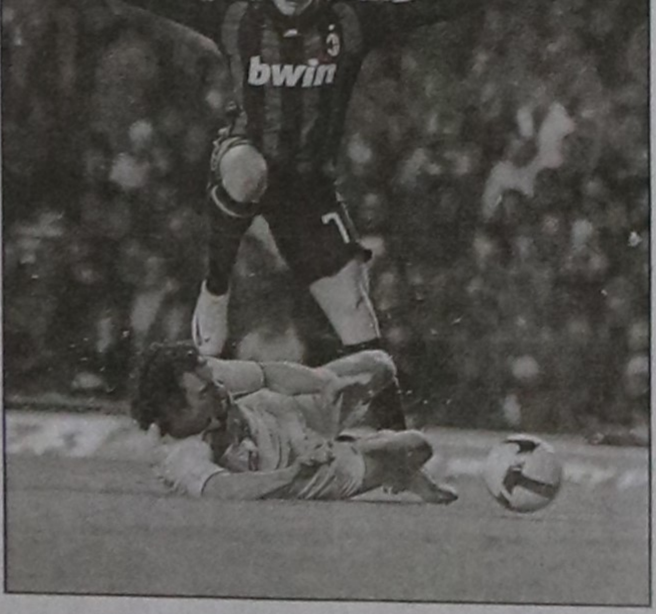
Milan striker Alexandre Pato (top) is slide-tackled by Rangers defender Christian Dailly during their friendly match at the Ibrox Stadium in Glasgow on Wednesday.

But Beckham, after playing in the first-half of Milan's 2-2 friendly draw with Rangers here at Ibrox on Wednesday, made no secret of where his heartlay.