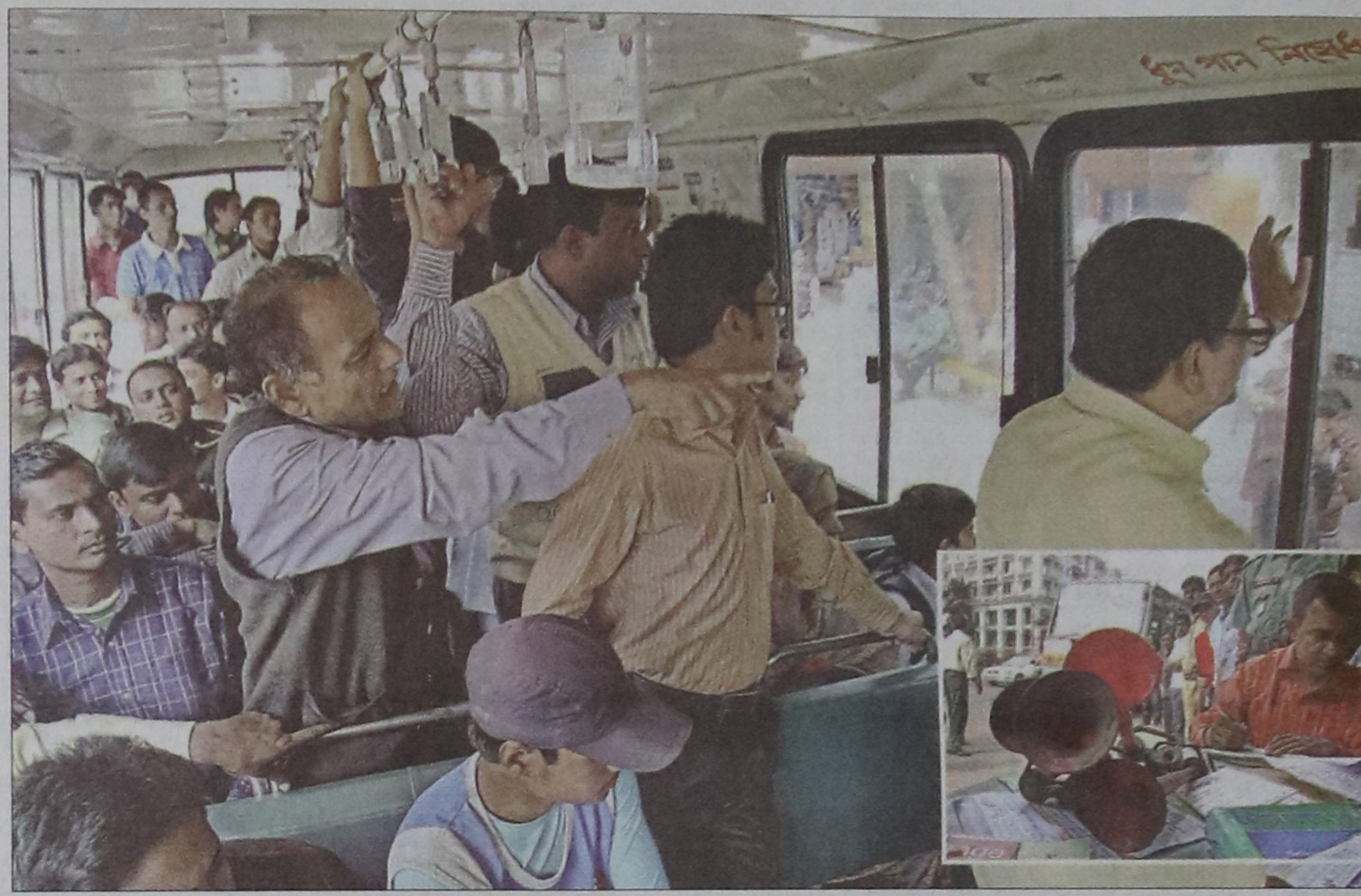
Bus passengers on Satmasjid Road in Dhanmondi, Dhaka, had to endure long wait as a mobile court stopped every bus and confiscated their loud horns yesterday. Inset, confiscated bus horns.