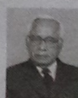
President People's Republic of Bangladesh

I am happy to learn that BRAC University is holding its 4 th Convocation on February 05, 2009. On this occasion, I convey my heartfelt felicitations to the graduating students their parents and the university authority as well.