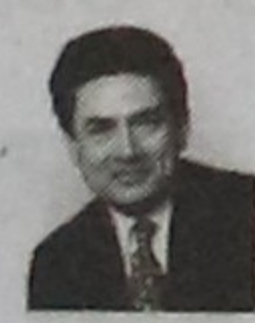
Former Chairman & CEO McKinsey & Company