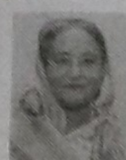
Prime Minister People's Republic of Bangladesh

I am pleased to learn that the 4 th Convocation of BRAC University is going to be held on 05 February 2009.