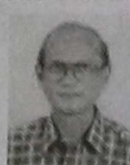
Minister, Ministry of Education & Ministry of Primary & Mass Education People's Republic of Bangladesh

It gives me much pleasure to congratulate the graduates on the successful completion of their studies at BRAC University. Each one of them has achieved an important milestone in life and will join a growing list of distinguished BRAC University Alumni.