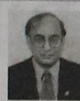
Vice Chancellor BRAC University

It gives me great pleasure to congratulate the fourth graduating class of BRAC University on this auspicious day.