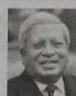
President, Governing Board BRAC University

First, let me offer my heartfelt congratulations to the graduates as we celebrate the Fourth Convocation of BRAC University. This is a proud moment for all of us as it represents the culmination of their hard work and achievement. It is not only our graduates that we celebrate today, but also their parents and the faculty and staff of the university who make this university the vibrant institution that it is.