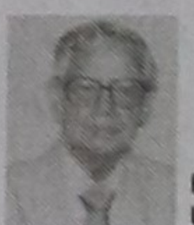
Former Professor of History University of Dhaka

It gives me great pleasure to learn that BRAC University is holding its 4 th Convocation on February 5, 2009. This is indeed a festive occasion, not only for the graduating students and their families but also for every member of the BRAC University family.