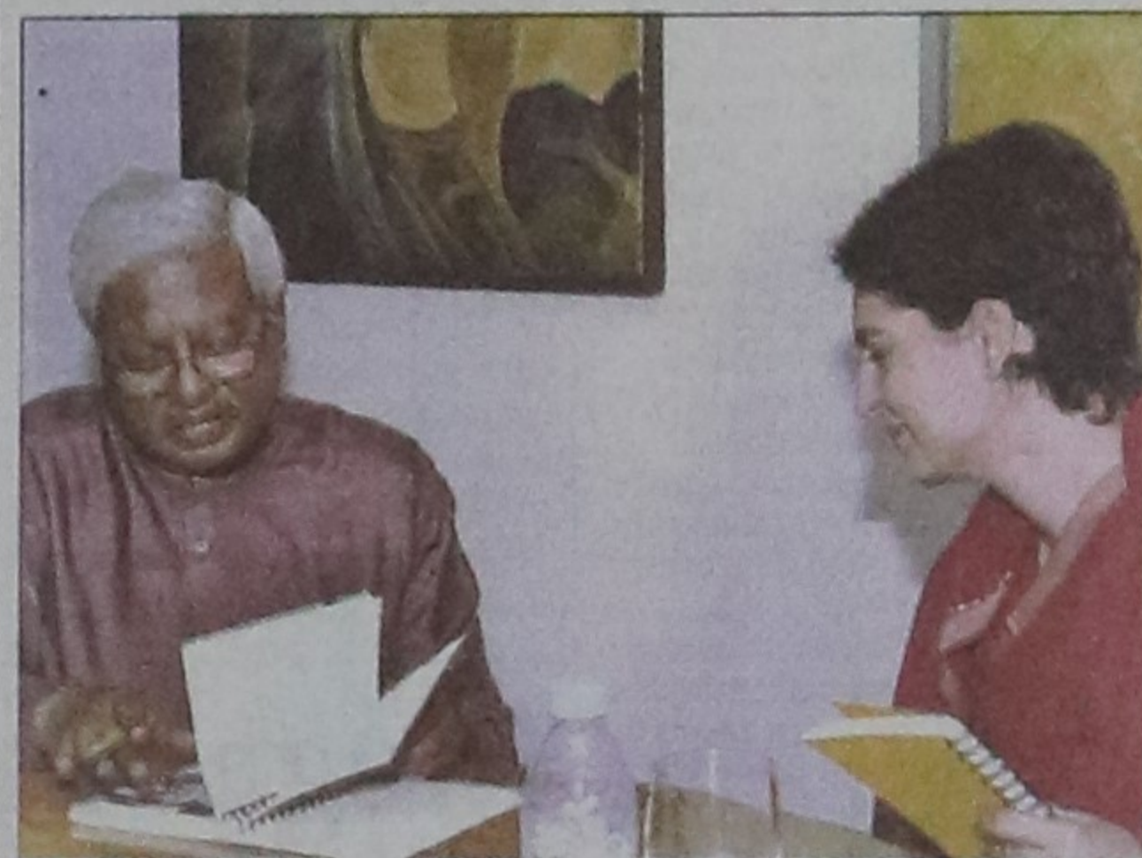
Priyanka Gandhi Vadra, daughter of former Indian premier Rajiv Gandhi and ruling Congress Party President Sonia Gandhi, calls on Brac Chairperson Fazle Hasan Abed at the Brac head office at Mohakhali in the city yesterday.