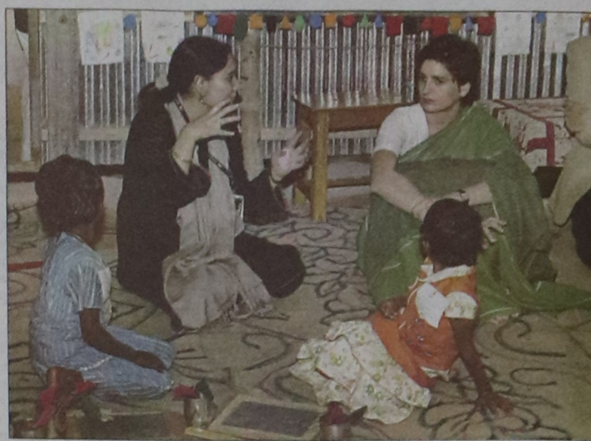
Priyanka Gandhi spends time with teachers and students of Brac Pre-primary School at Charabagh in Savar, Dhaka, yesterday. Her two-day visit to Bangladesh ends today.

Priyanka, a trustee board member of the Rajiv Gandhi Foundation, is scheduled to discuss today with the high officials of Brac and likely to finalise terms of reference to introduce Brac Education Programme in India, according to a press release of Brac.