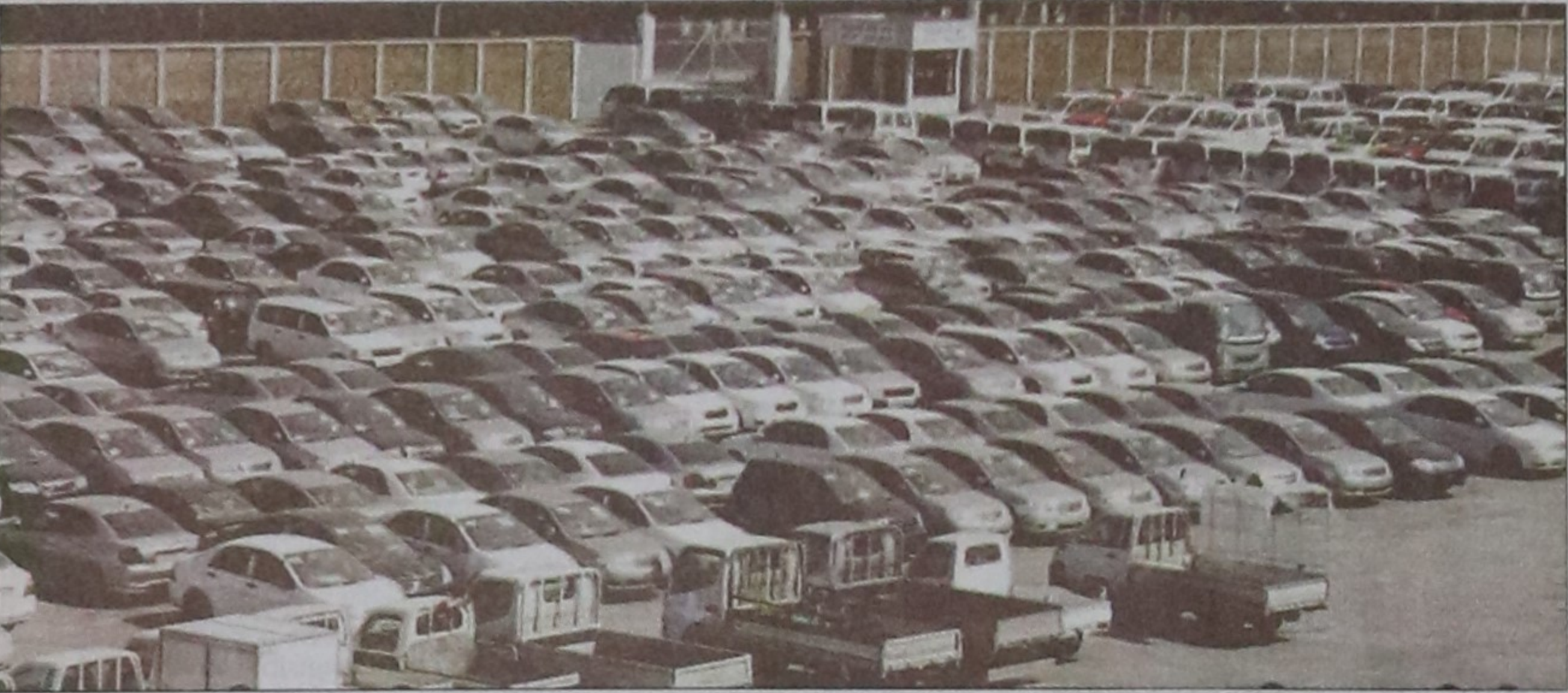
Hundreds of imported reconditioned vehicles are kept in the new container yard at Chittagong Port as the vehicle sheds are already crammed with cars.

The congestion at the port also marked a little improvement with the number of vehicles inside the port coming down to around 4,600 on Saturday last after the figure stood over 5000 over the previous weeks, sources at the CPA said.