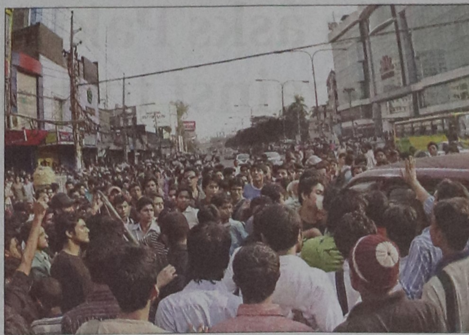
Students of Daffodil International University demonstrate on Mirpur Road in the city yesterday protesting attacks by local traders. (Story on Page 2)

Preparation for filing a general diary was on when this report was filed yesterday.