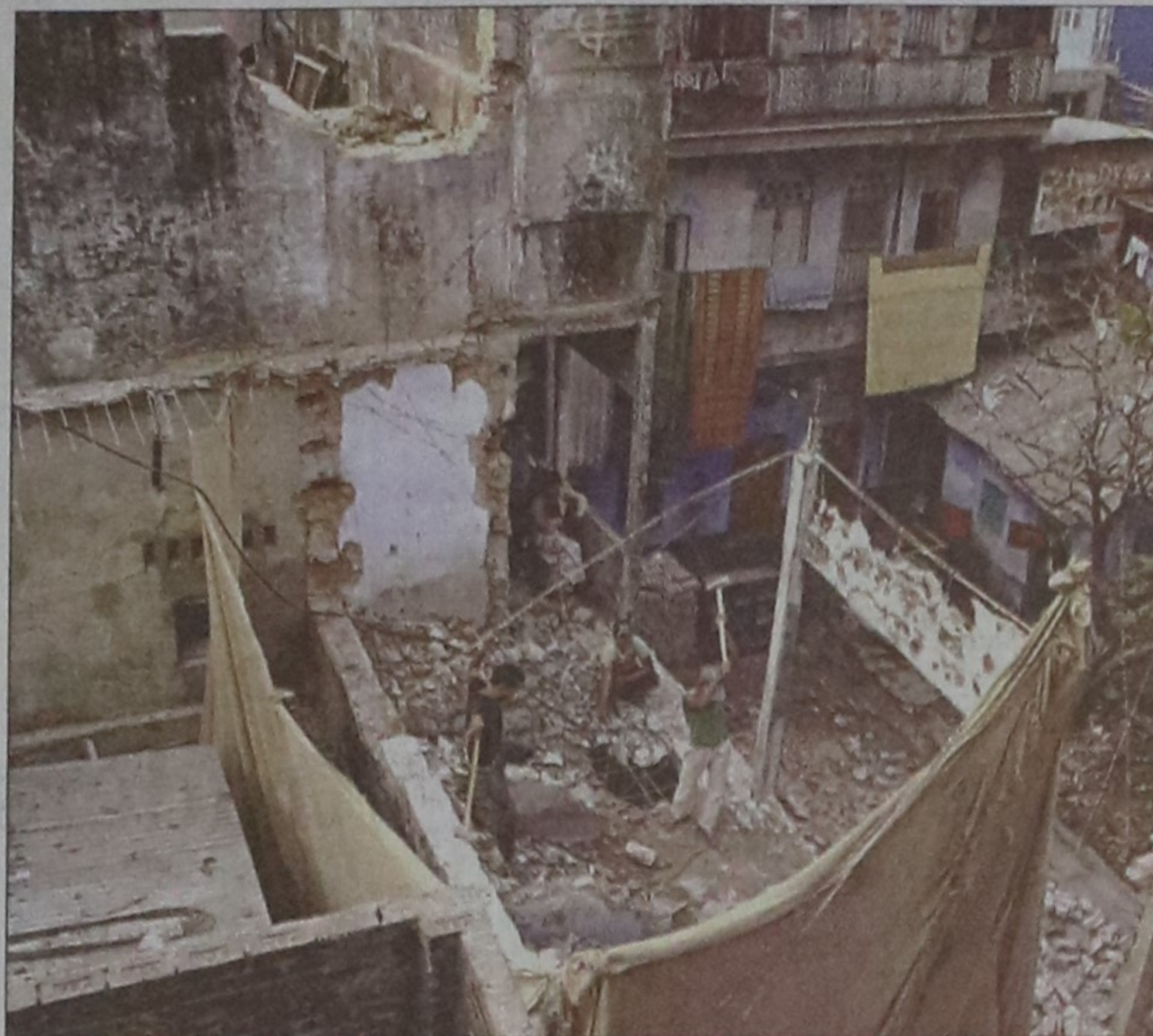
A century-old building being torn down at Shankharibazar in Old Dhaka as the owner wants to erect a multi-storey building there.