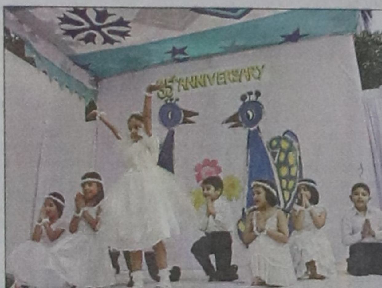
Children perform at the programme.

On February 2, Tiny Tots School celebrated its 35th Anniversary on the school campus in Mohammadpur amidst much fanfare, according to a press release. The school took on a festive hue, as it was decorated with wall paintings by children.