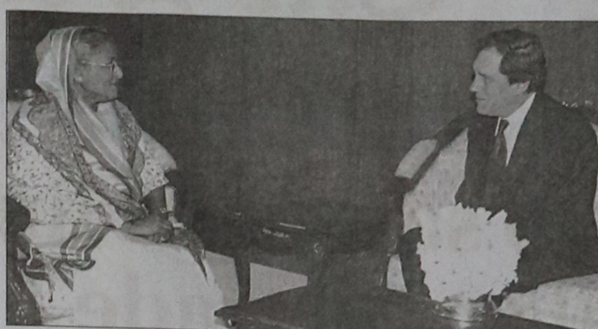
Karl F. Inderfurth, former assistant secretary of state for South Asian Affairs of the United States, calls on Prime Minister Sheikh Hasina at her Secretariat office in the city yesterday.

This visit underscores the importance of the cooperation on security, humanitarian assistance and terrorism between the two countries, the US embassy press release added.