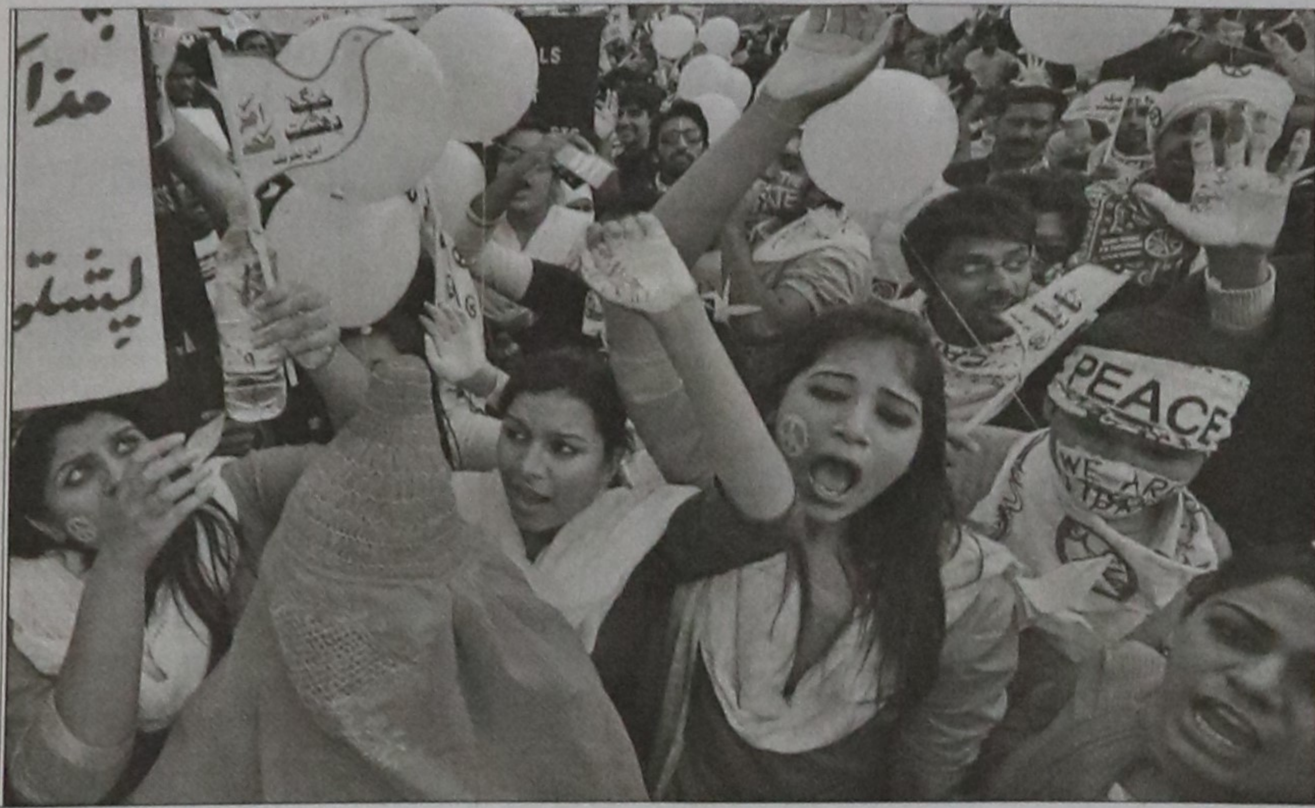
Pakistani human rights activists march at a peace rally in Lahore Saturday. The peace rally was organised to make an emphatic and vigorous appeal to both sides - Pakistan and India - of the divide to shun arms and make peace with each other in the larger interest of the country, region and posterity.