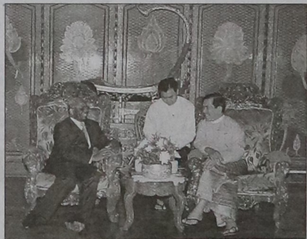
UN envoy Ibrahim Gambari (L) meets with Myanmar Foreign Minister Nyan Win (R) at the former war office in Yangon on Saturday. Gambari started his four-day visit to military ruled Myanmar for political reforms.