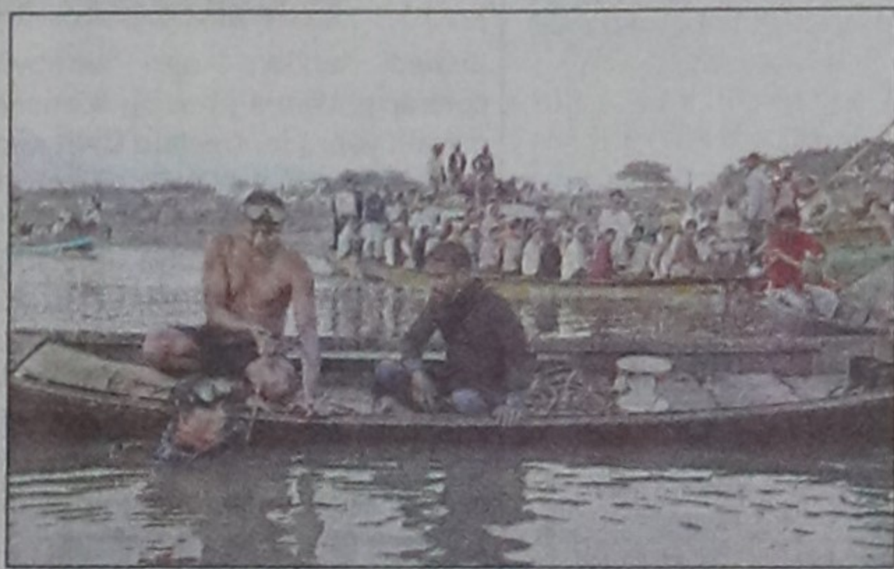
(Clockwise) Leader of the Opposition Khaleda Zia and Prime Minister Sheikh Hasina offer prayers during the Akheri Munajat of Biswa Ijtema at Tongi yesterday. Thousands of devotees return to the city on the boats. Divers search for the missing after a trawler carrying devotees capsized in the river Turag. Devotees attend the Ijtema on boats on the Turag since there was no space left on the Biswa Ijtema ground.