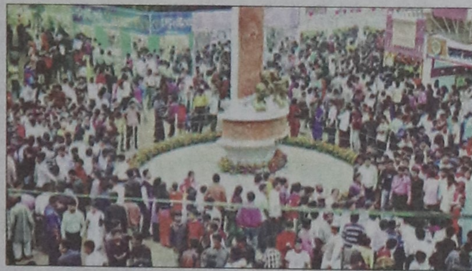
A glimpse from last year's fair.