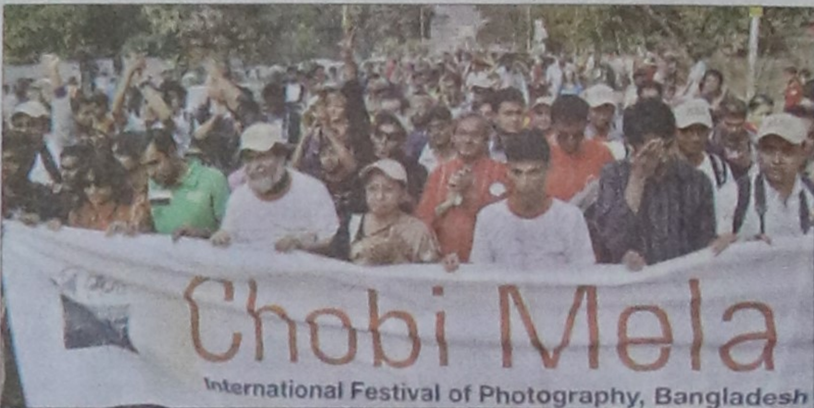
Jubilant photographers at the rally celebrating the festival.