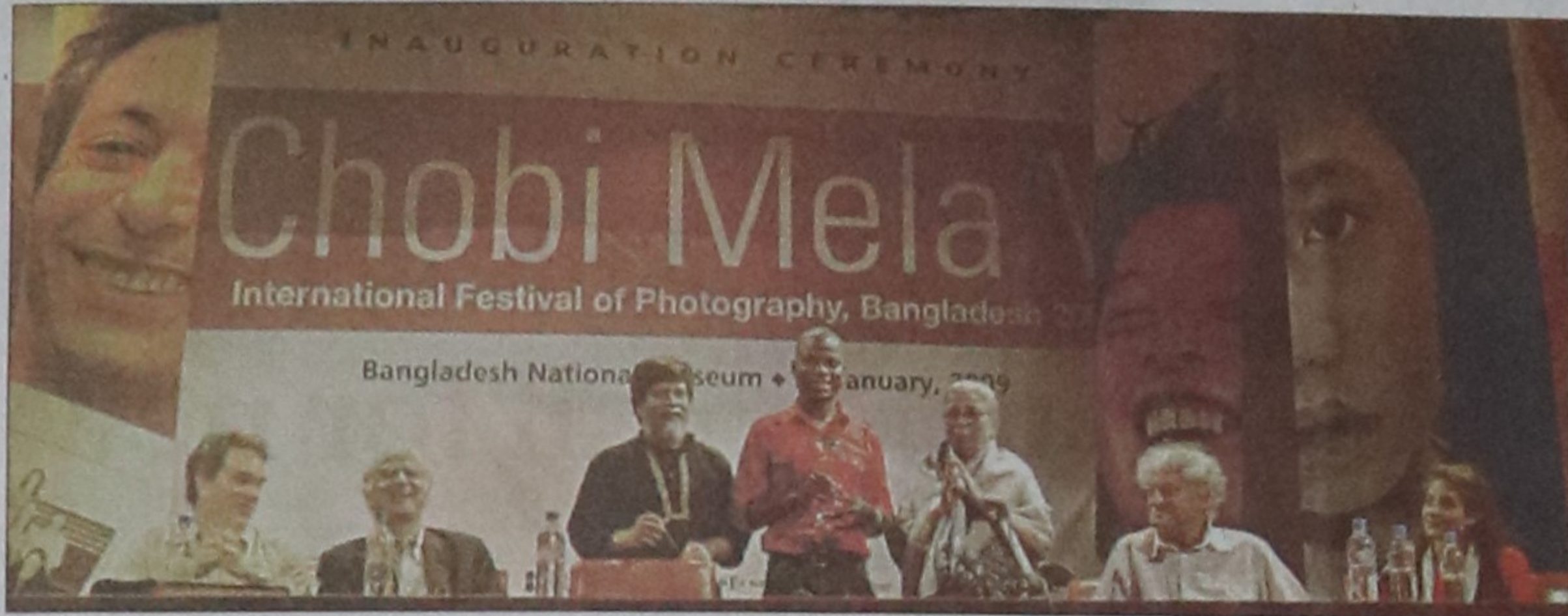
Speakers share their experience on photography as a universal language at the event.

This year's Life Time Achievement Award was given to the Doyen