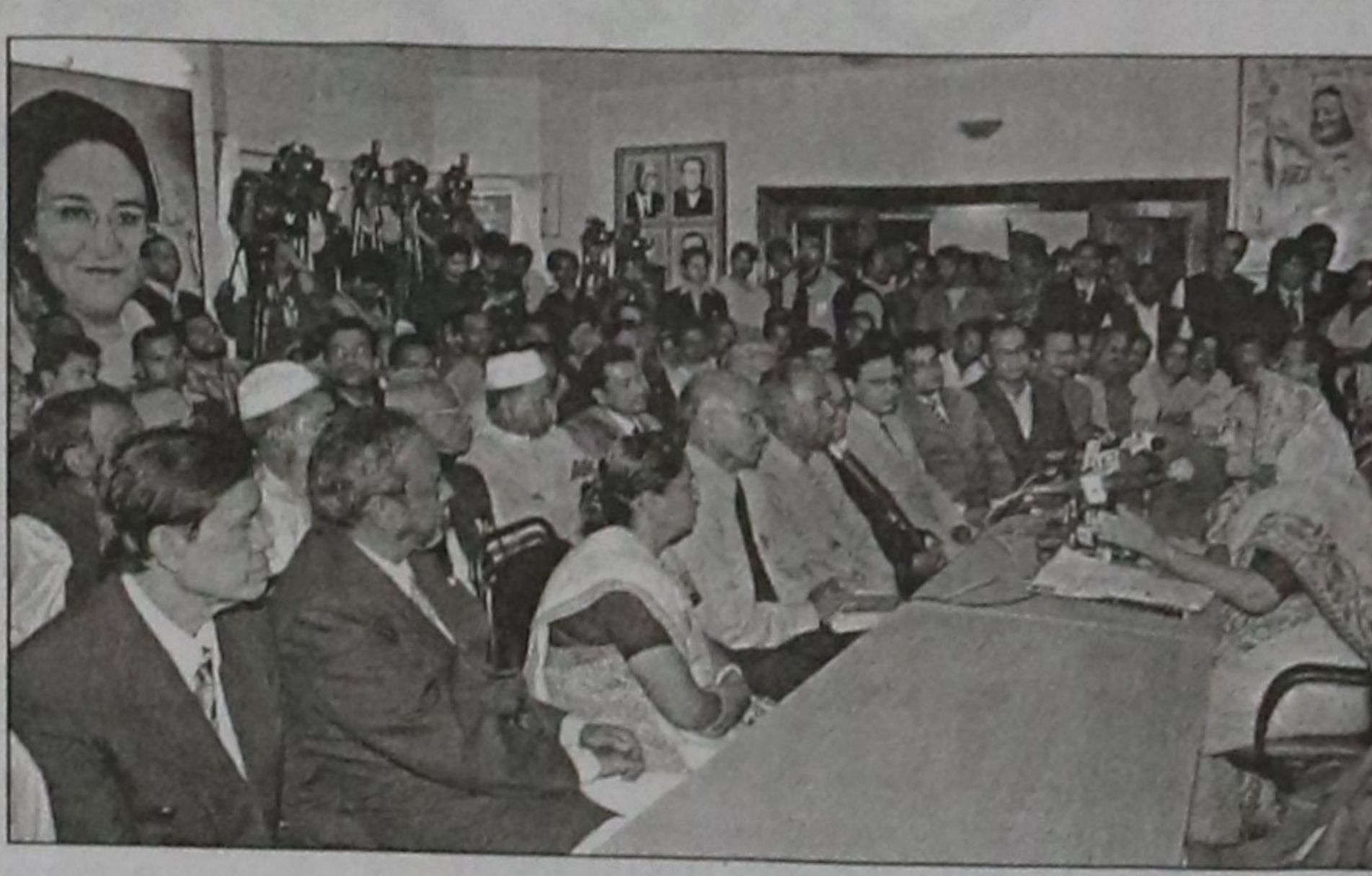
Prime Minister Sheikh Hasina speaks at a meeting of newly elected upazila chairmen and inhabitants from Kotalipara and Tungipara at Awami League office at Dhanmondi in the city yesterday.

FROM PAGE 16 The two things are quite different in nature and their purposes. "Binod Bihari asks all to unite" - This section discusses Binod Bihari's call for unity among political parties, students, and the general public in the context of the hunger strike and the current political climate.