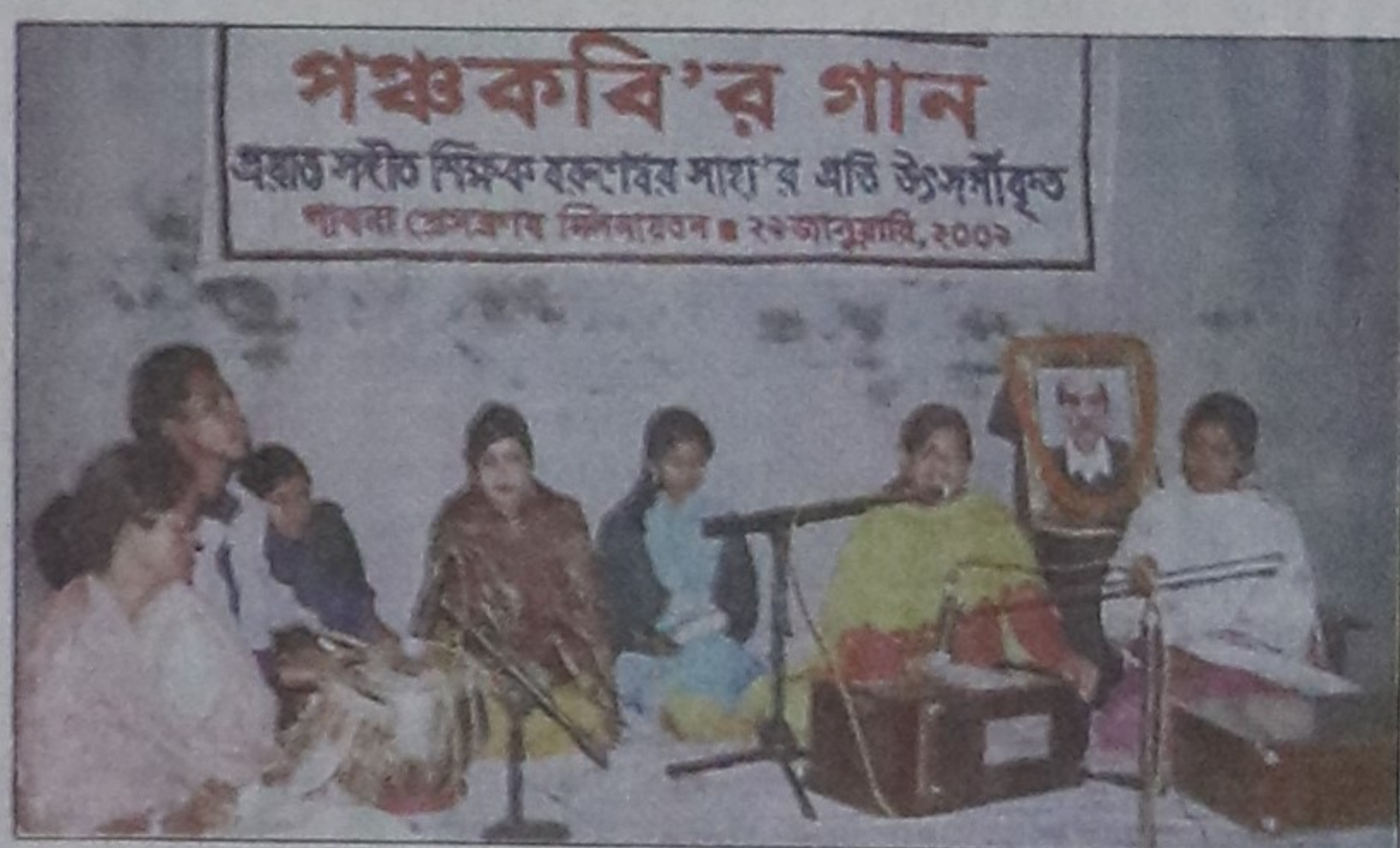
Artistes performed 'Pancha Kobir Gaan' at the programme marking Bangladesh Gonoshilpi Sangstha's 25th anniversary.

Prior to the musical programme, a discussion was held. Speakers on the occasion focused on the roles of these legendary poets in Bengali literature and music. Speakers however