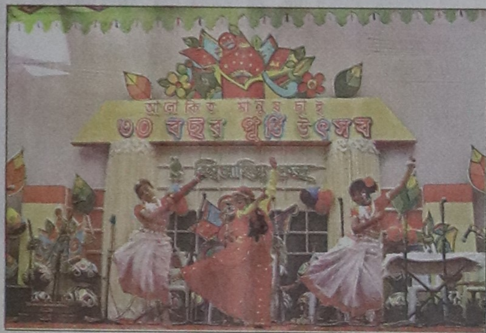
The anniversary celebration included a cultural programme featuring songs, recitation and dance.