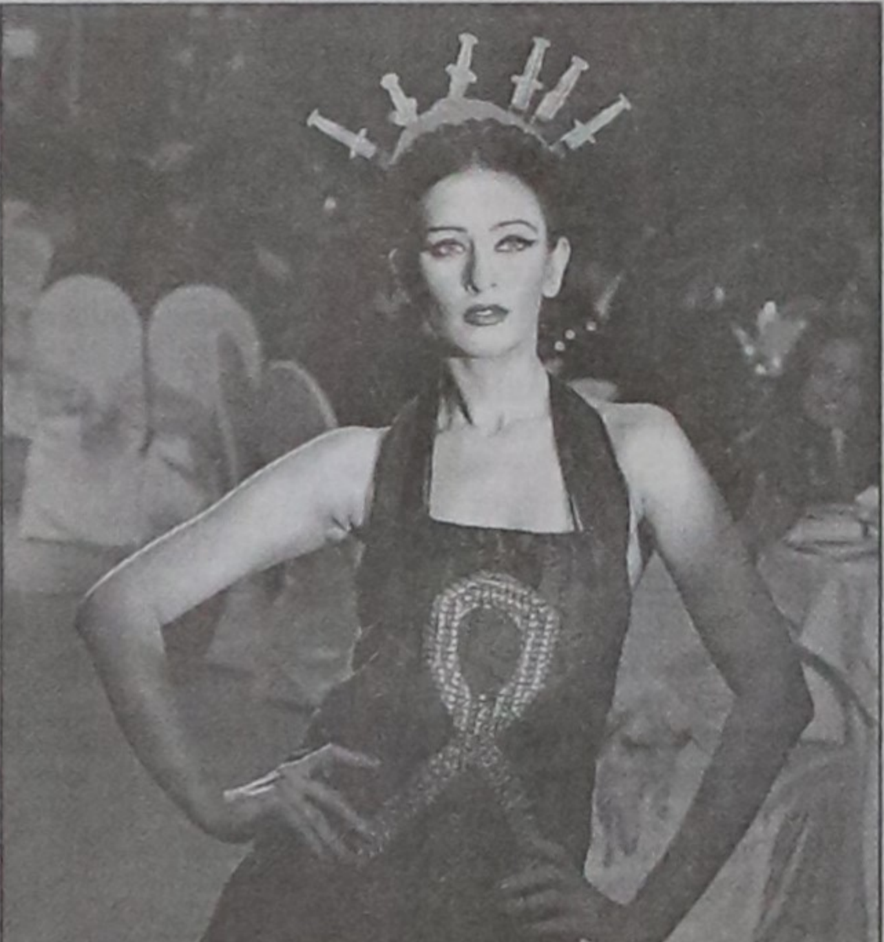
A model sashays down the catwalk at the UNAIDS-organised Red Ribbon fashion show 'UN Ball' in collaboration with UNWA at Hotel Radisson in the city yesterday.

On the occasion, Qurankhwani and doa mahfil will be held at his village home in Comilla.