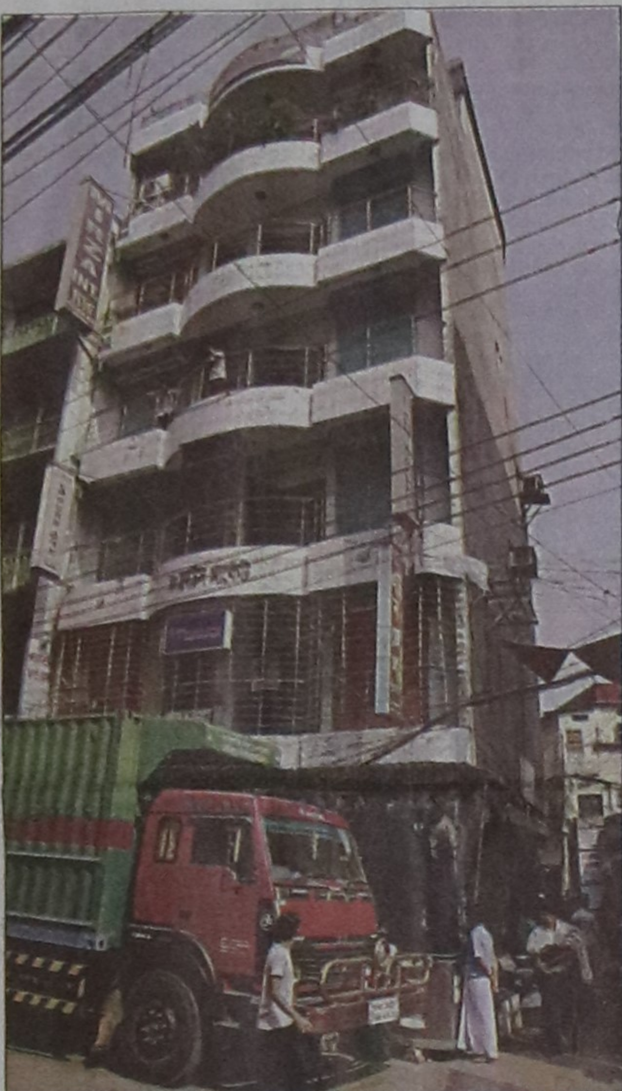
Chhatra Dal leaders occupied Crown Bhaban hostel of Jagannath University, left, at Patuatuli and made it a shopping arcade. Even the DCC set up a school "leasing" Bazlur Rahman Hostel, right top, in Mughaltuli while cops have taken over Abdur Rahman Hall at Armanitola in Old Dhaka. More pictures on page 5.