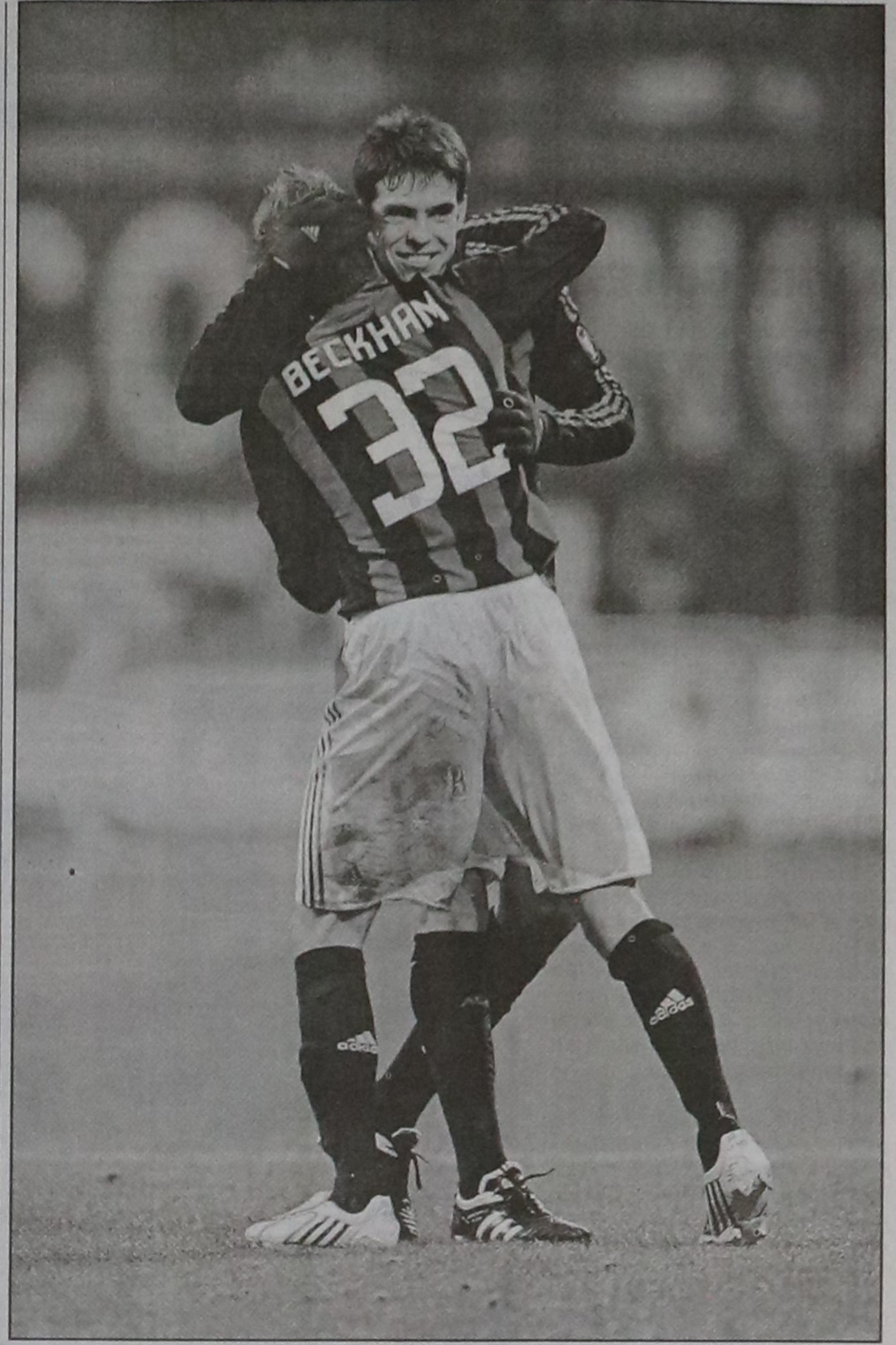
Milan midfielder David Beckham (jersey number 32) hugs teammate Kaka after scoring the opening goal against Genoa during their Serie A football encounter at San Siro on Wednesday.