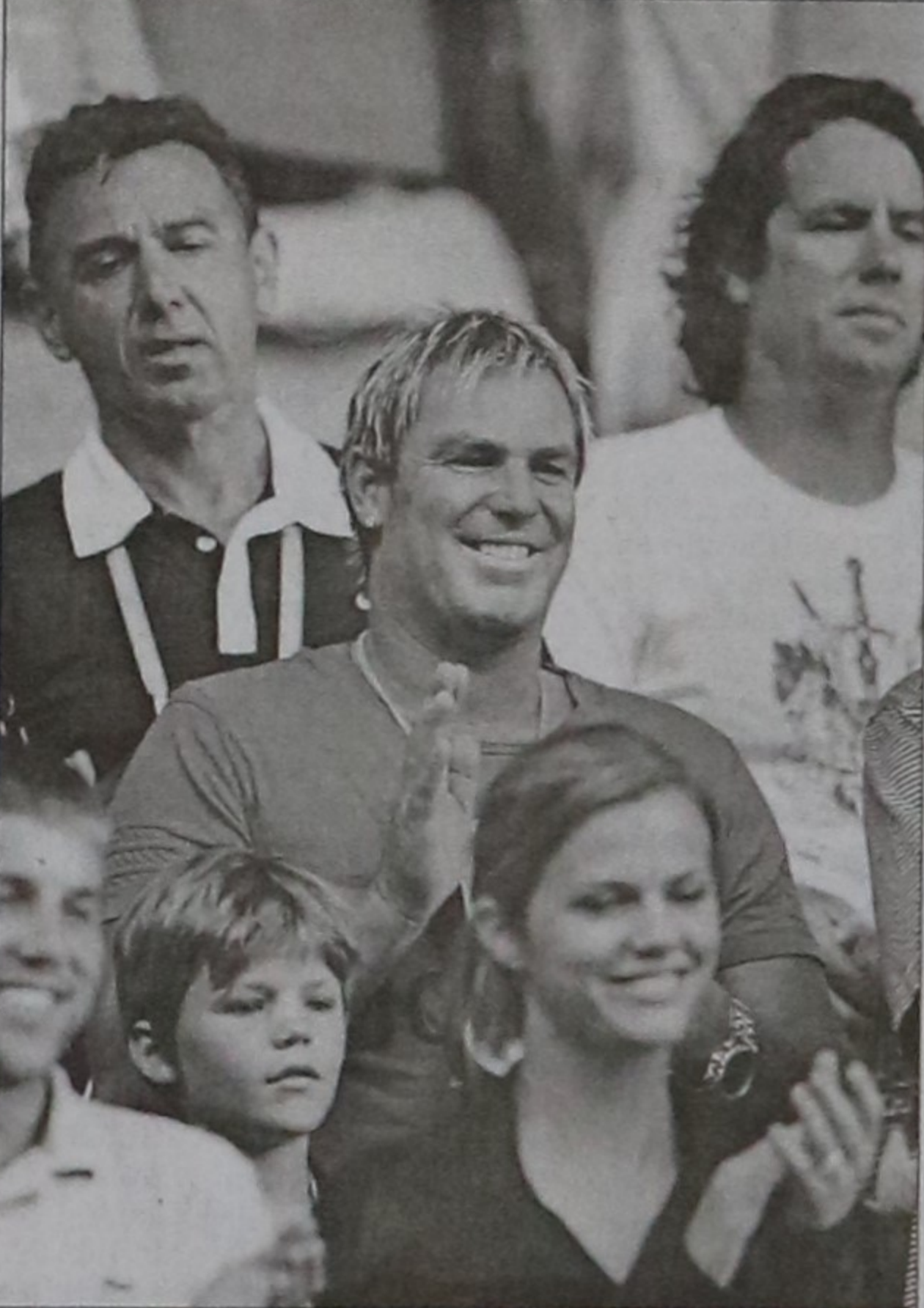
Australian cricket legend Shane Warne (C) enjoys the Australian Open match between American Andy Roddick and Spaniard Tommy Robredo in Melbourne yesterday.

He said a bowler like Mendis preferred to keep three or four fielders close to bat. "It means there are open spaces in the field. Even a mis-hit can give you boundaries," he explained.