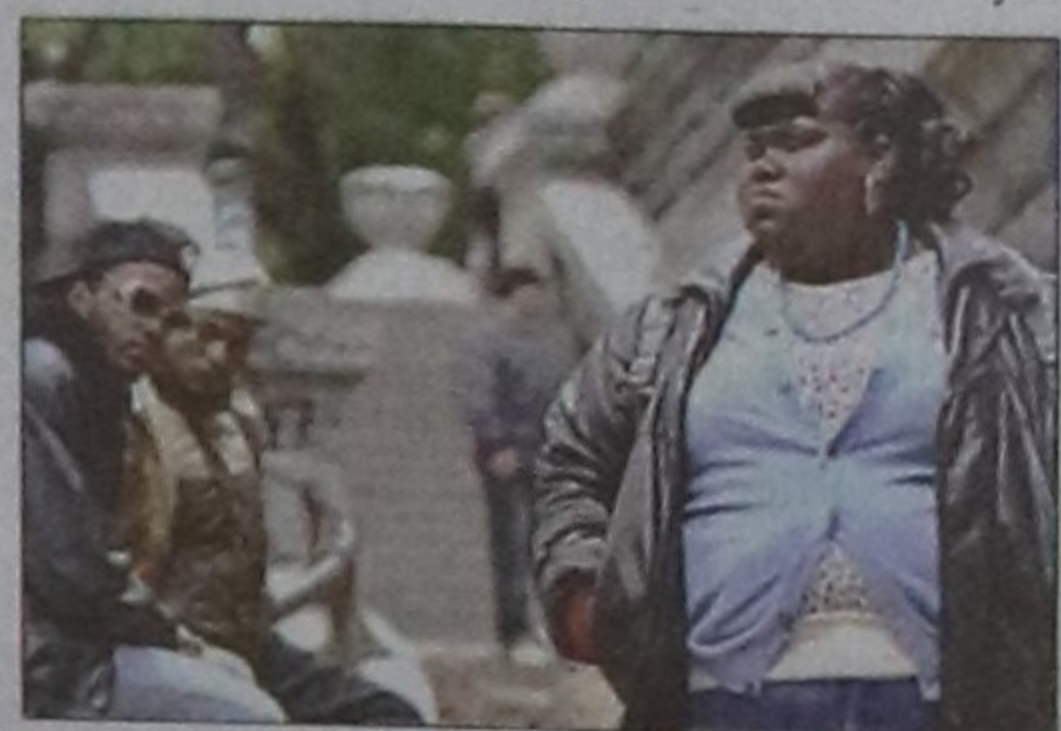
"Push" tells the story of an embattled teenager living in 1980s Harlem.

Sundance, backed by Robert Redford's Sundance Institute for filmmaking, is the top gathering for US independent cinema, and each year the movies seen there are released to fanfare in theatres around the United States and the world.