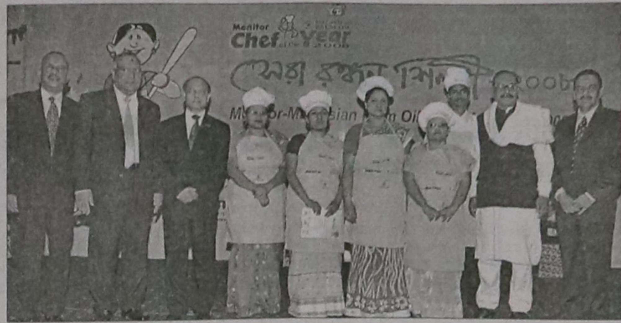
Post and Telecommunications Minister Rajiuddin Ahmed Raju, 2nd-R, poses for photograph with the winners of the Chef of the Year 2009 contest, co-organised by Monitor and Malaysia Palm Oil at Dhaka Sheraton Hotel yesterday. General Moeen U Ahmed, the army chief, who attended the programme as special guest, is also seen.

Vodafone, the Netherlands-based company, had bought a 67 per cent stake in Hutchison Essar from Hutchison Telecom International (HTIL) in February 2007 for $11.2 billion.