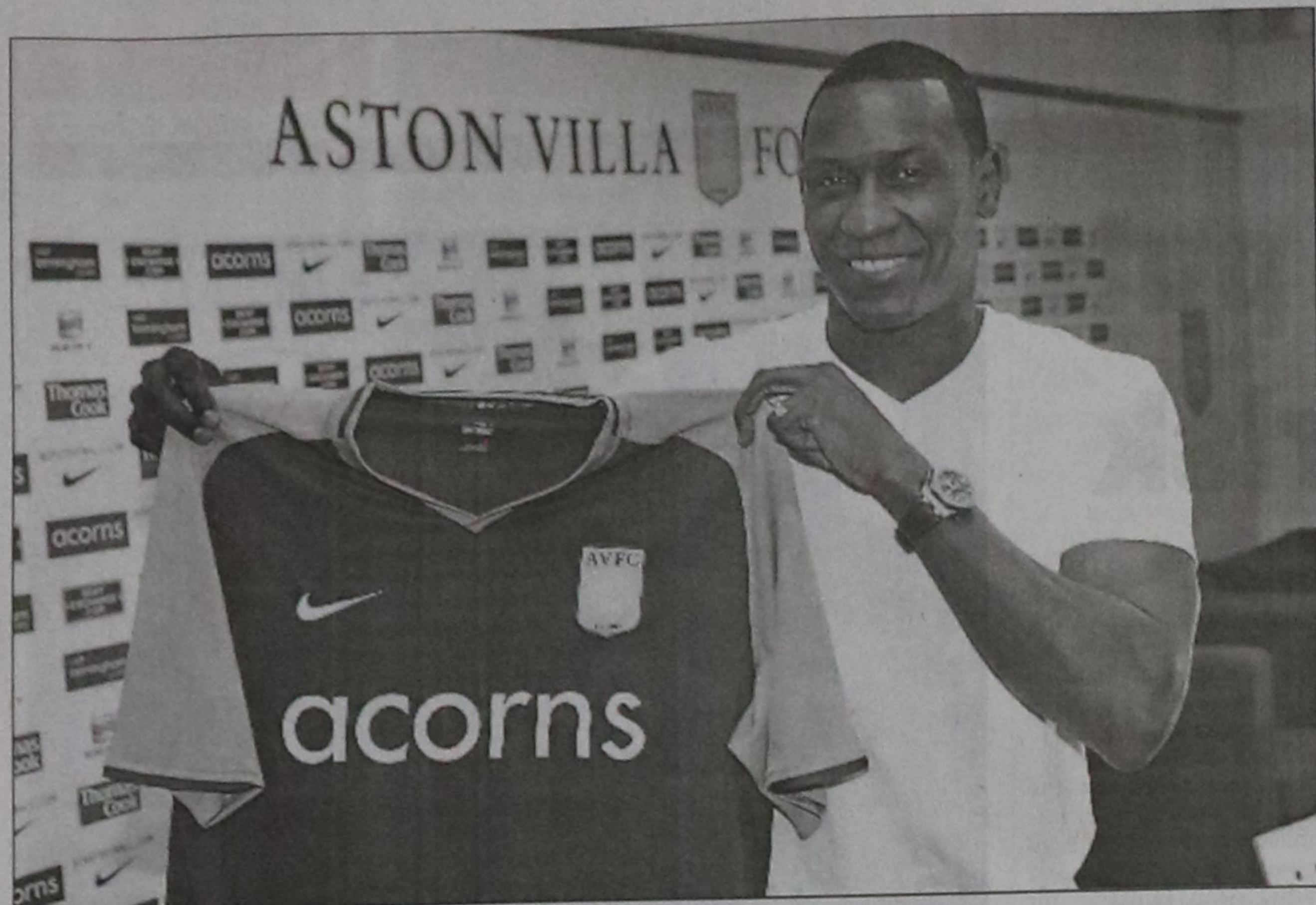
Aston Villa's new signing Emile Heskey holds up his team shirt in Birmingham on Friday.