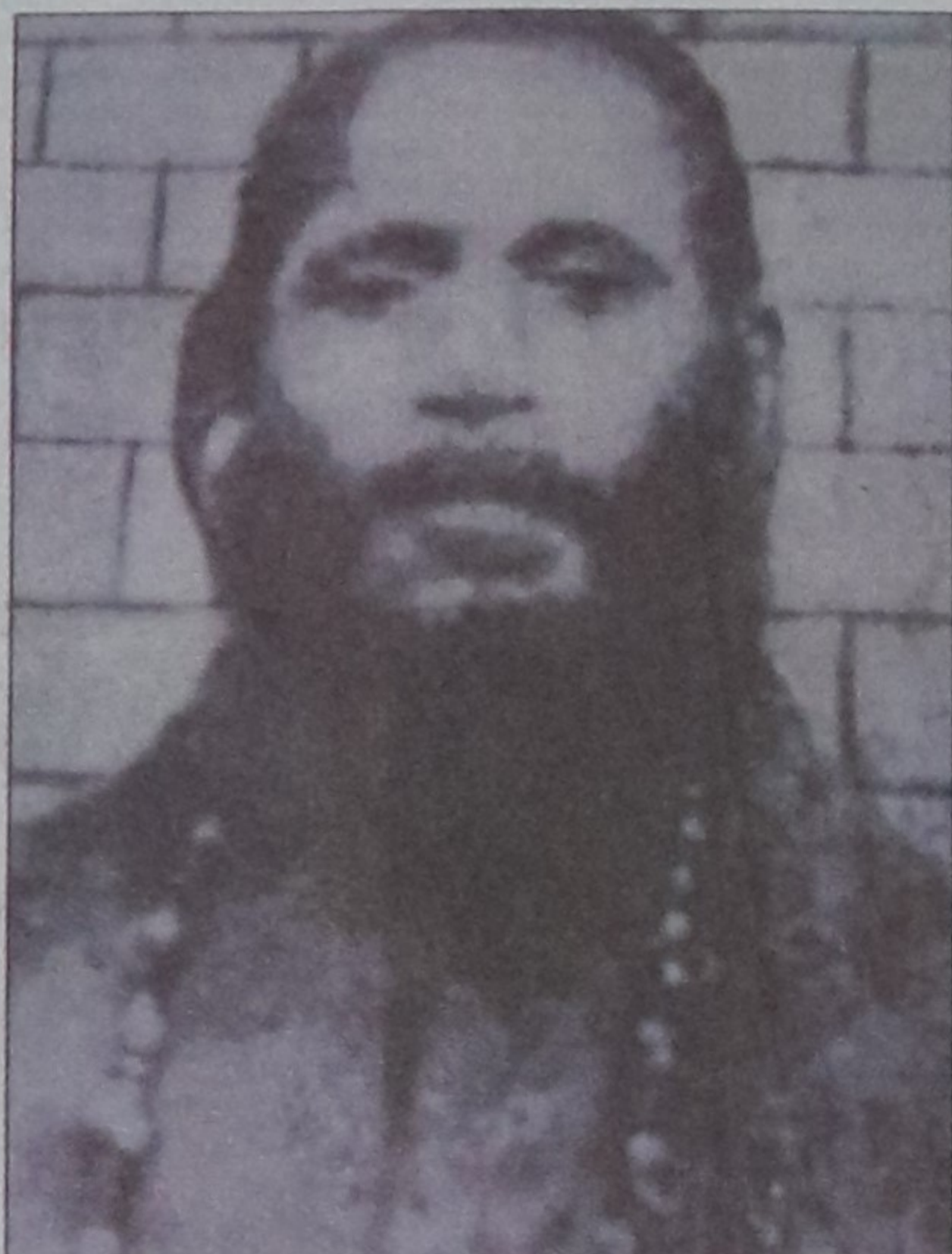
Fakir Aftabuddin Khan

The writer is Bangladesh Ambassador to Russia.