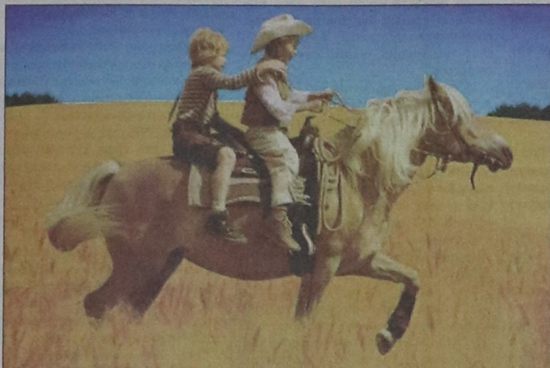
A scene from "Hands Off Mississippi"; the film will be screened at the opening of 2nd International Children's Film Festival beginning tomorrow.

The festival will be held simultaneously at