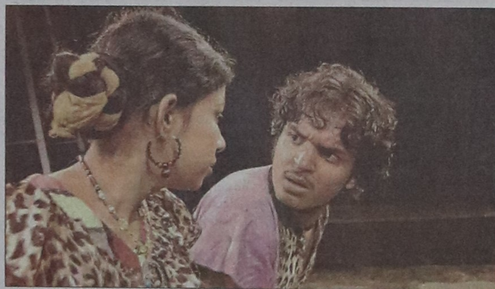
"Jungle Dahon" traces the history and struggles of the Rakhains.

Written and directed by Animesh Saha Litu, "Jungle Dahon" traces the history and struggles of the Rakhains. After losing a battle in their native region, Arakan (in the present day Myanmar), Rakhains migrated to the coastal areas of Bangladesh in the seventeenth century. They set up homes in the heart of jungles, remote hills and other inaccessible areas. Yet, their homes and lands were often snatched away from them. The characters of the play narrate the ongoing struggle of the Rakhains. In the play, the struggle is symbolised with an encounter