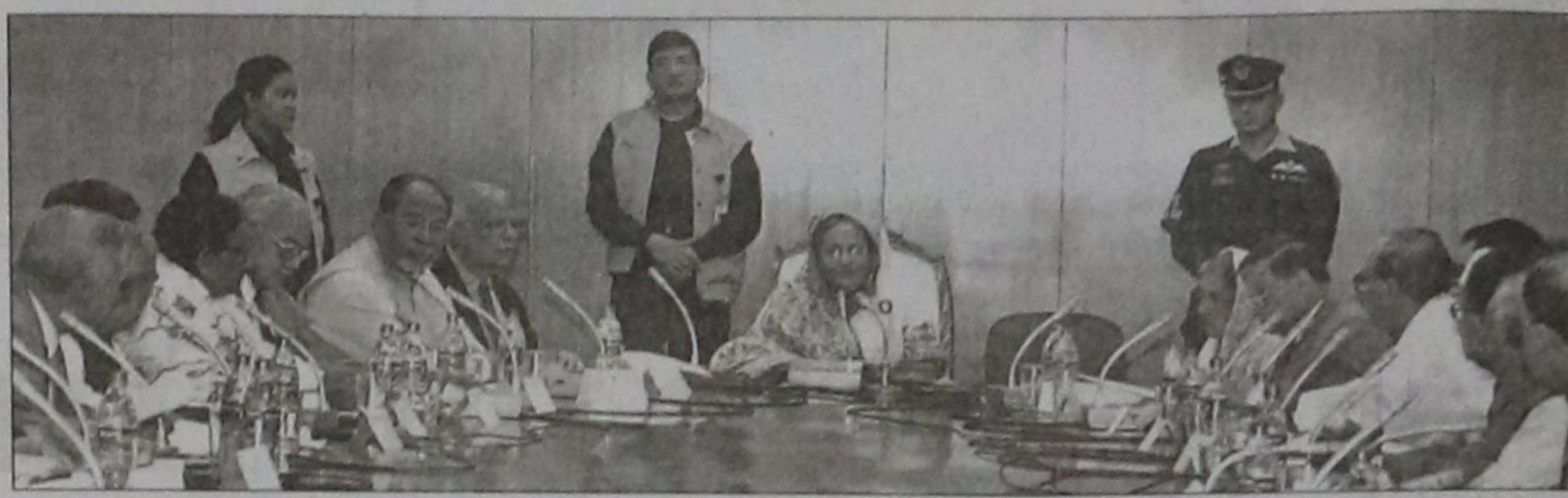
Prime Minister Sheikh Hasina presides over a cabinet meeting at the Secretariat in the city yesterday. (Story on Page 1)

Barrister Moudud Ahmed appeared for the petitioners.