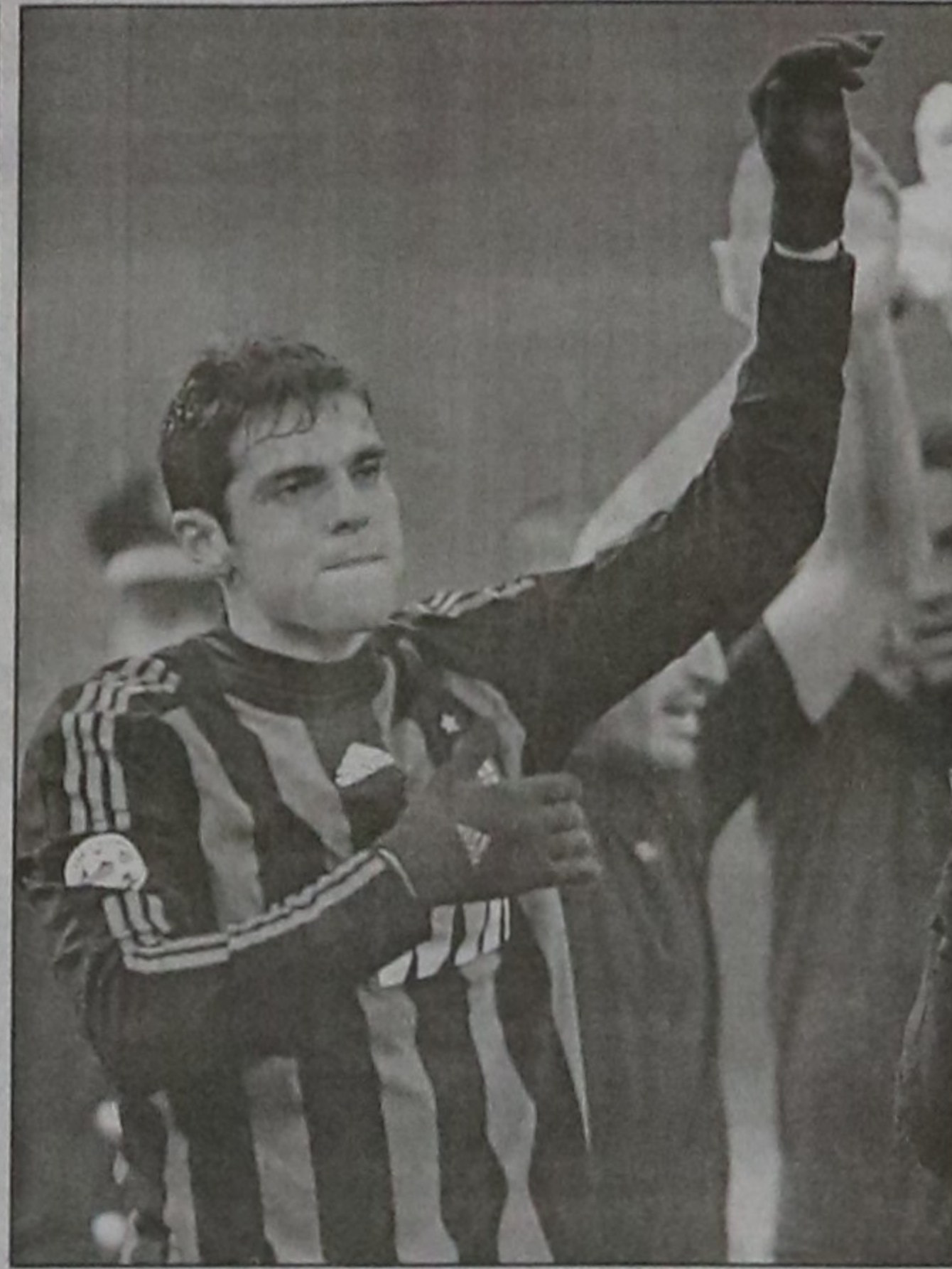
(L) AC Milan fans showcase where their heart lies by displaying a banner that reads 'Kaka has no price' during their Serie A match against Fiorentina at the San Siro in Milan on Saturday. (R) A grim-looking Kaka asks the fans to keep the faith by gesturing towards the club badge at the end of the game; an apparent sign of his willingness to stay on at a club where he feels at home.