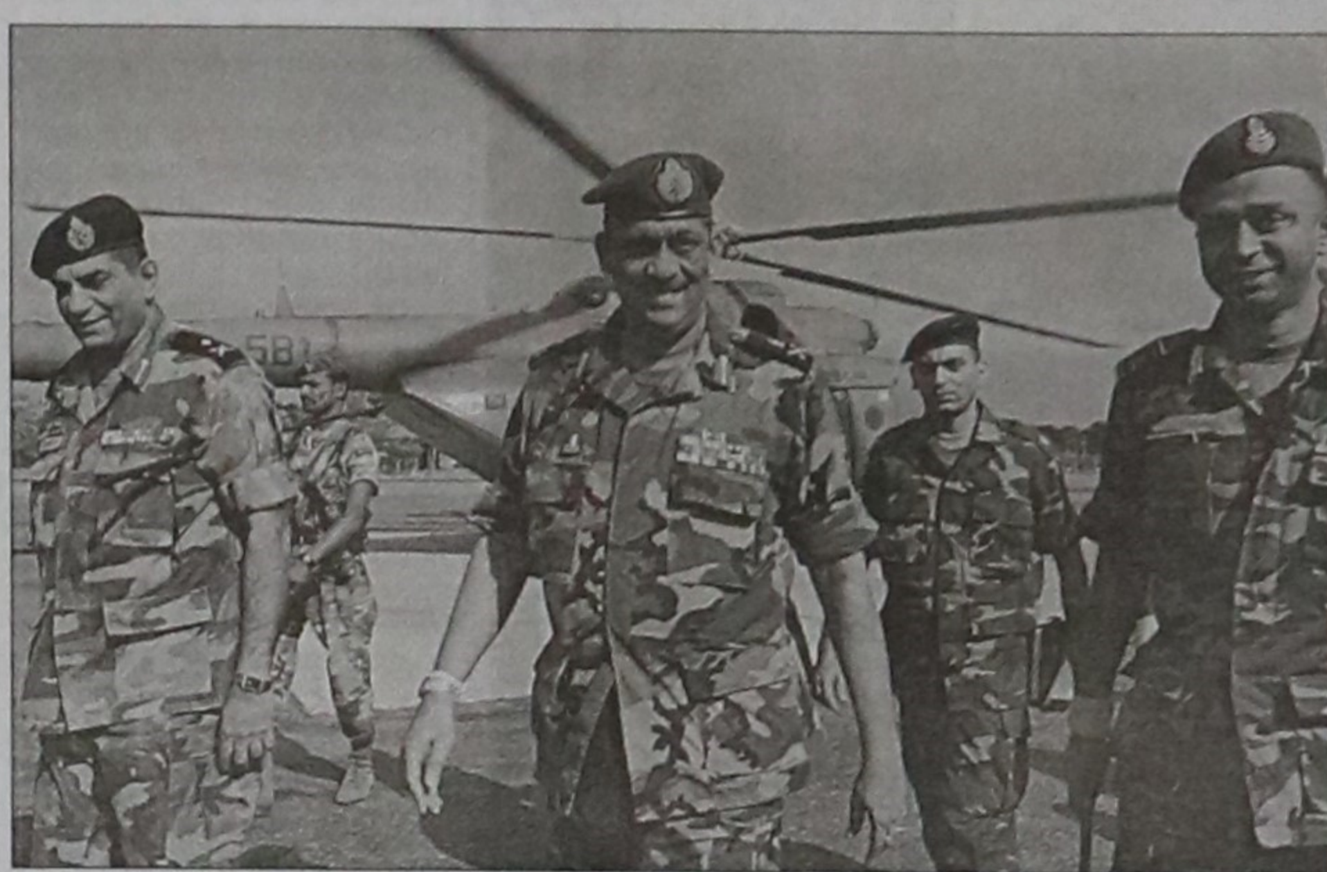
Sri Lankan Defence Ministry photo shows Army Chief Sarath Fonseka (C) visits troops at the northern base of Vavuniya to meet with front line field commanders. Lt General Fonseka said that his troops had surrounded Tamil Tiger rebels in their last remaining urban stronghold of Mullaitivu and the guerrillas had no option but to jump in the Indian Ocean.

AFP, Peshawar Pakistani paramilitary forces killed at least 15 Taliban militants in intense gunbattles in a northwestern tribal area bordering Afghanistan, a security official said yesterday. One soldier was also killed in the fighting, which broke out Saturday as paramilitary forces were clearing a key road linking the Bajaur tribal district with provincial capital Peshawar, the official said. "Fifteen militants were killed in a successful raid by security forces on a militant stronghold in Darwazgai area of Mohmand Agency," the official said. "One security forces personnel embraced martyrdom in the encounter," he said, adding that the militants fired mortars at troops from their hide-outs. The toll could not be confirmed independently as the area is out of bounds due to the military operation. Mohmand lies just south of the Bajaur tribal region, where Pakistani troops have fought militants for months in an operation the military says has left more than 1,700 insurgents dead. The campaign extended into Mohmand in recent weeks. The US has praised the Pakistani military offensive, saying it has put pressure on insurgents along the border who are involved in attacks on American and Nato forces in Afghanistan.