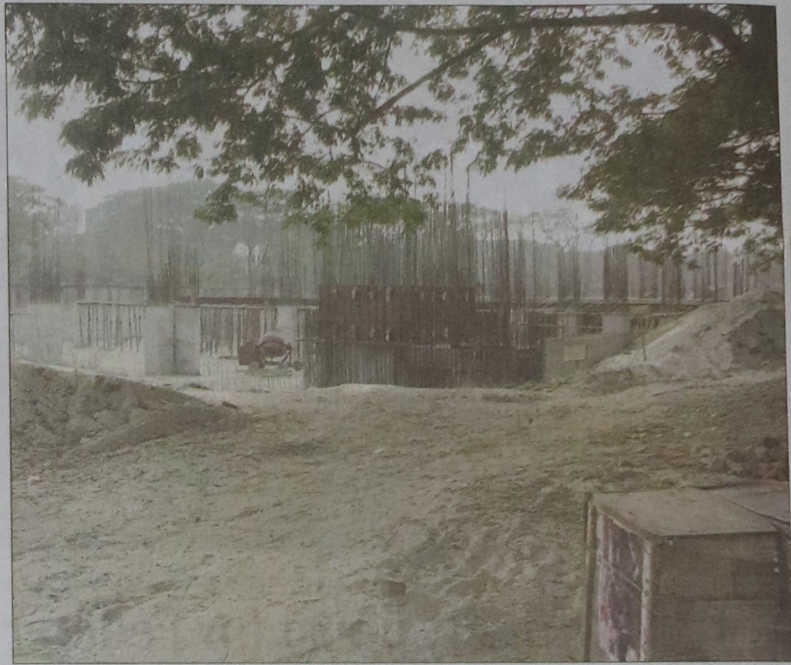
Site of the Birdem's 'Teaching Hospital' in Mirpur.