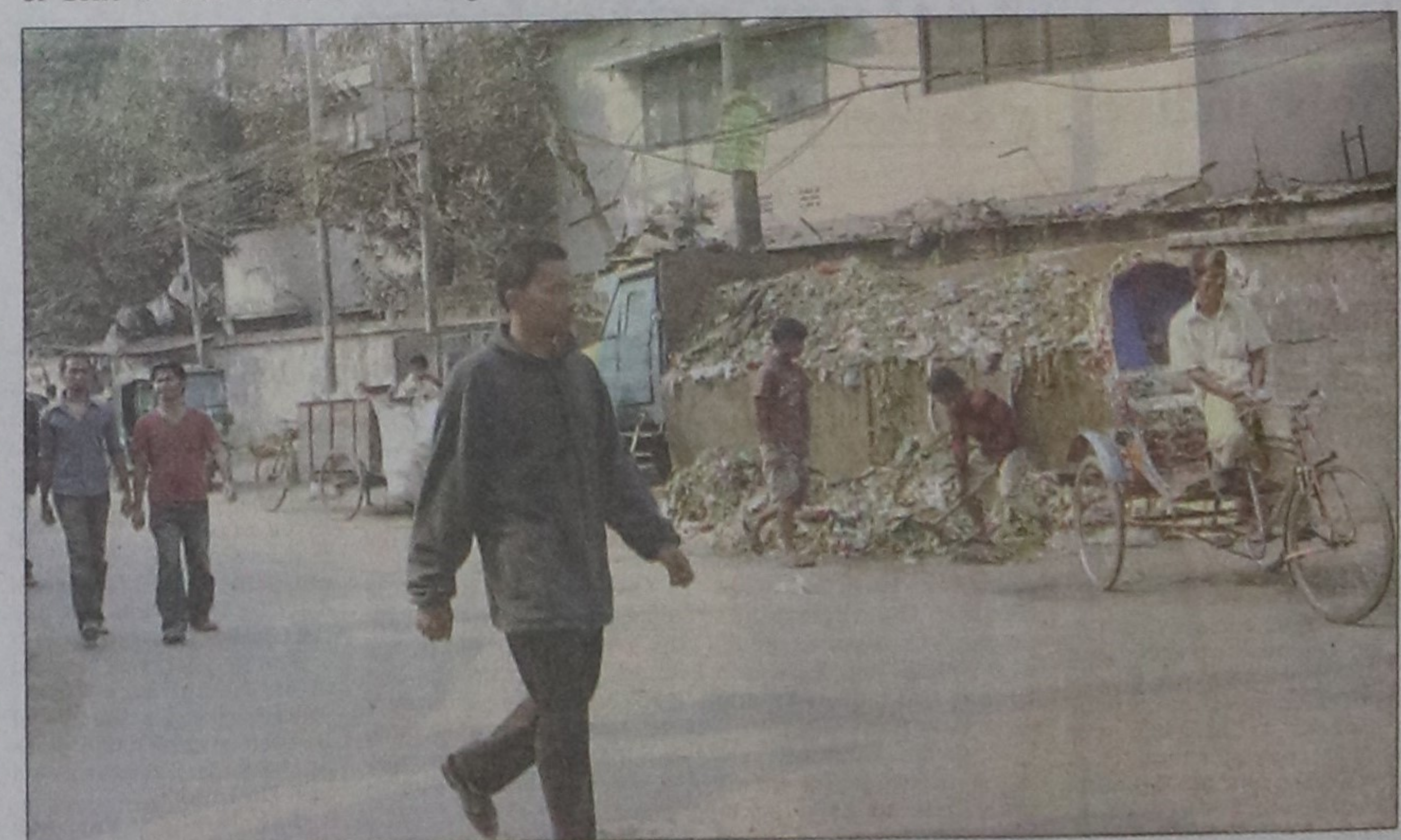
A DCC truck collects garbage from the dump in West Nakhhalpara.

Rajuk's town planner Mortaza said it is not Rajuk's job to set up dustbins. Right now Rajuk's main concern is the Bijoy Sarani extension to Tejgaon Link Road. If they have to demolish any dustbin in the area, then they will allocate a suitable place after discussing with the DCC.