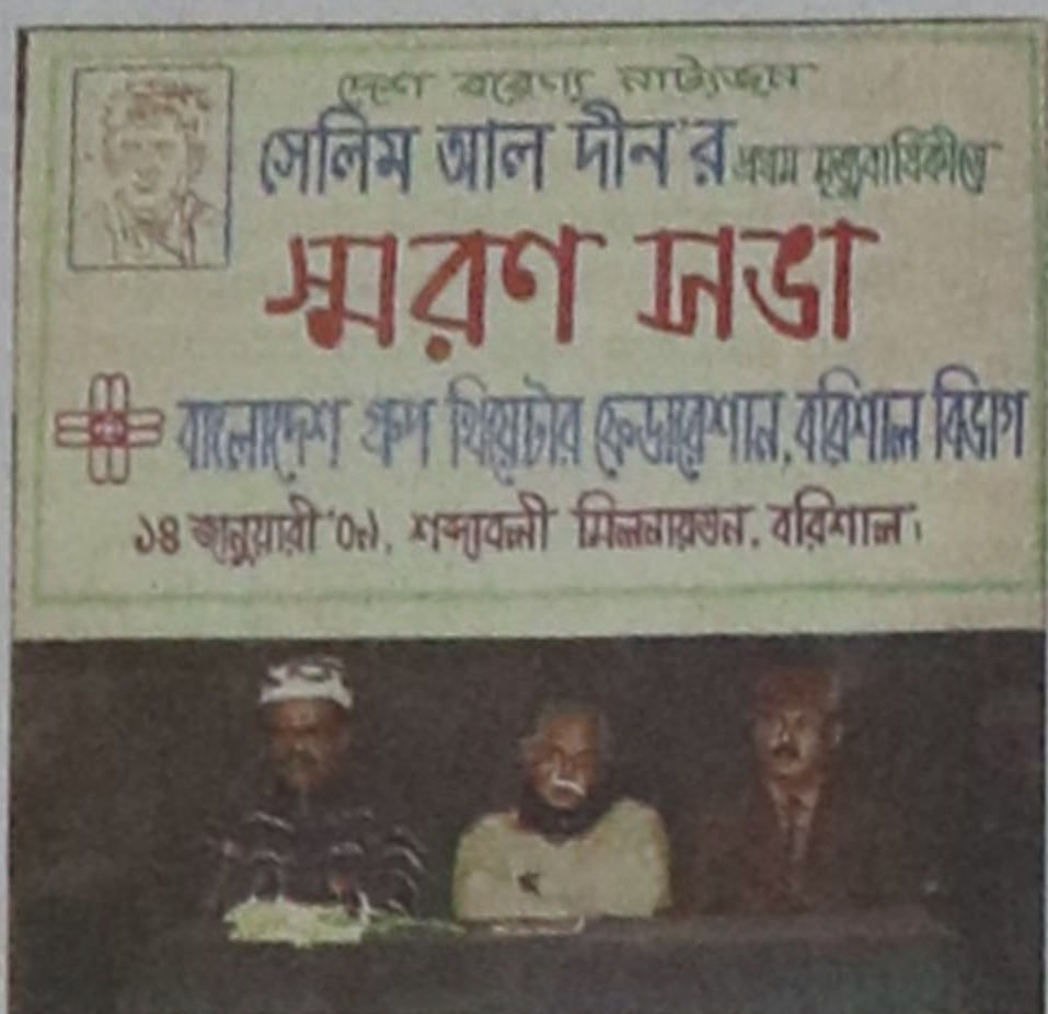
Discussants at the memorial meeting.

Selim Al Deen is the only playwright in Bangla literature after Rabindranath Tagore to