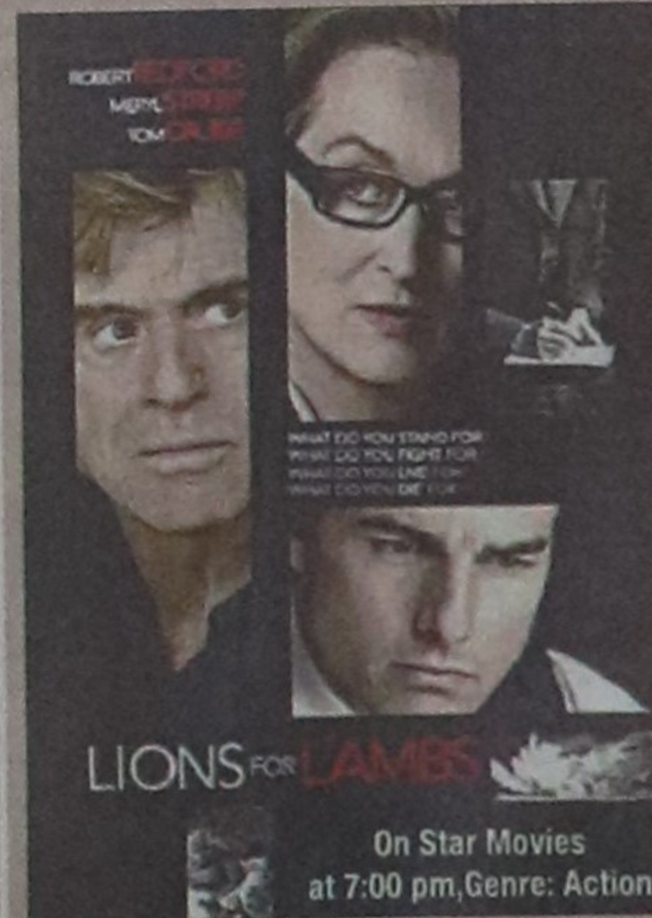
On Star Movies at 7:00 pm, Genre: Action