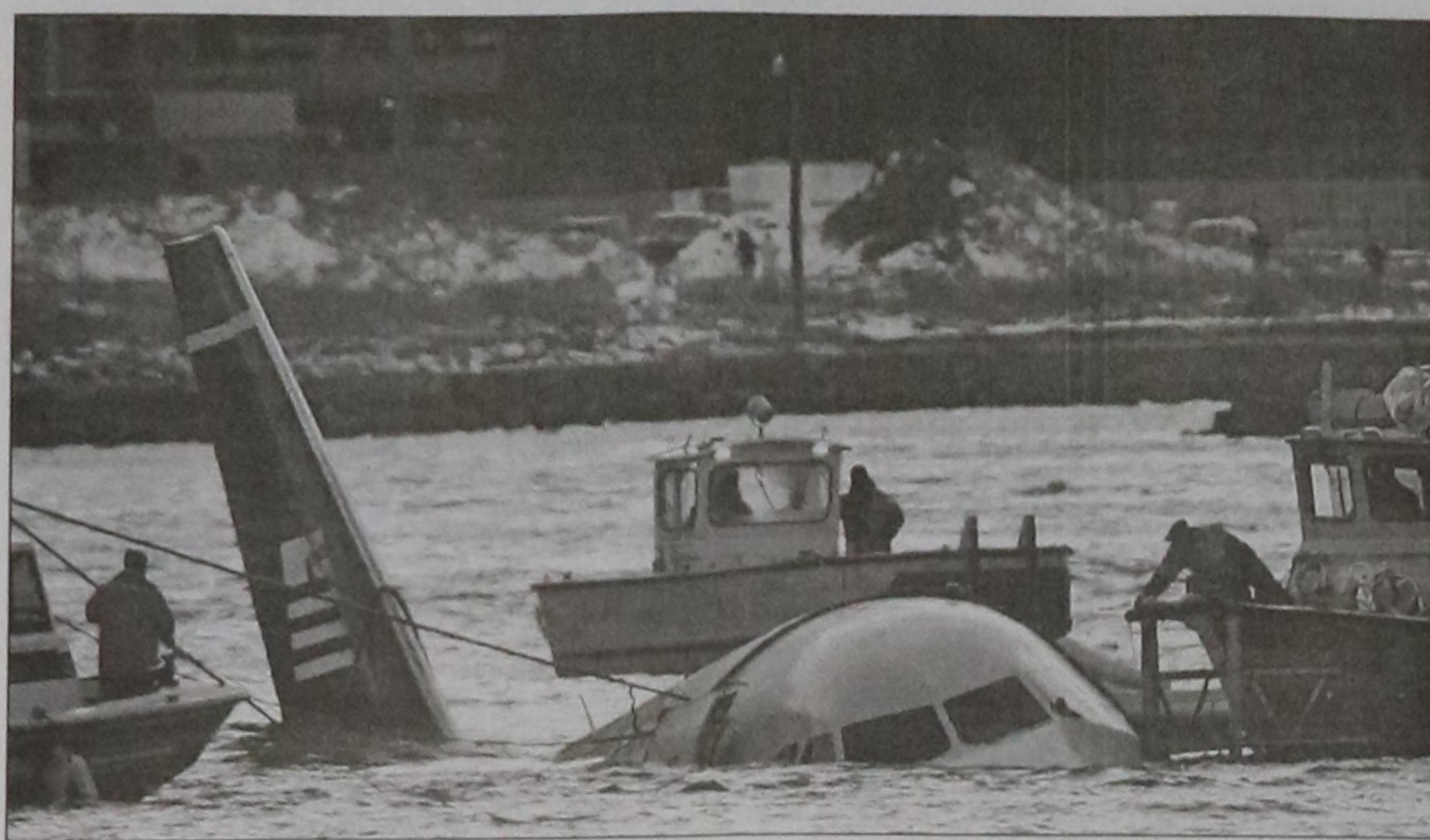
Rescue crews secure a US Airways flight 1549 floating in the water after it crashed into the Hudson River on Thursday in New York City. The Airbus 320 craft crashed shortly after take-off from LaGuardia Airport heading to Charlotte, North Carolina.