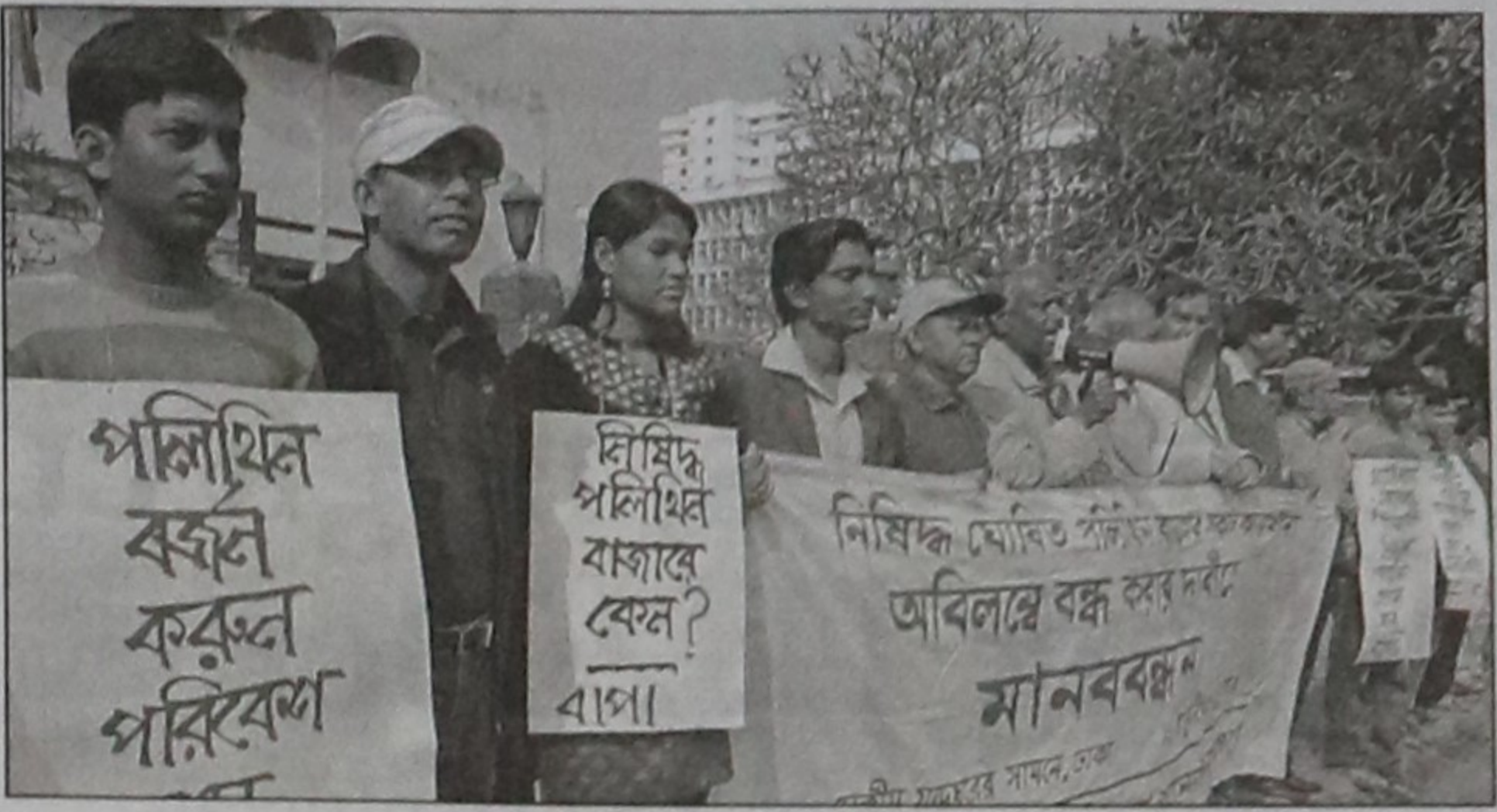
Bangladesh Paribesh Andolon forms a human chain at Shahbagh in the city yesterday demanding that all polybag factories be closed to stop the use of polybags.

"The government has the ability to afford the subsidy. If we did not have the requisite money, we would not have taken such a step," she told BSS.