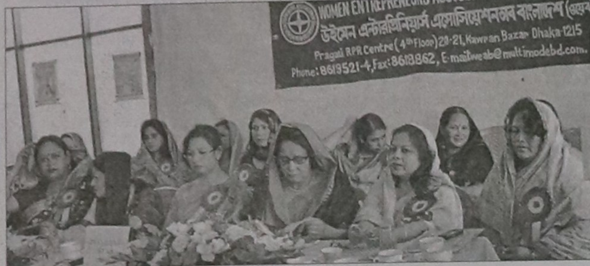
Members attend the ninth annual general meeting of the Women Entrepreneurs Association of Bangladesh in Dhaka yesterday.

"There is not a country in the region that is not slowing sharply or in outright recession."