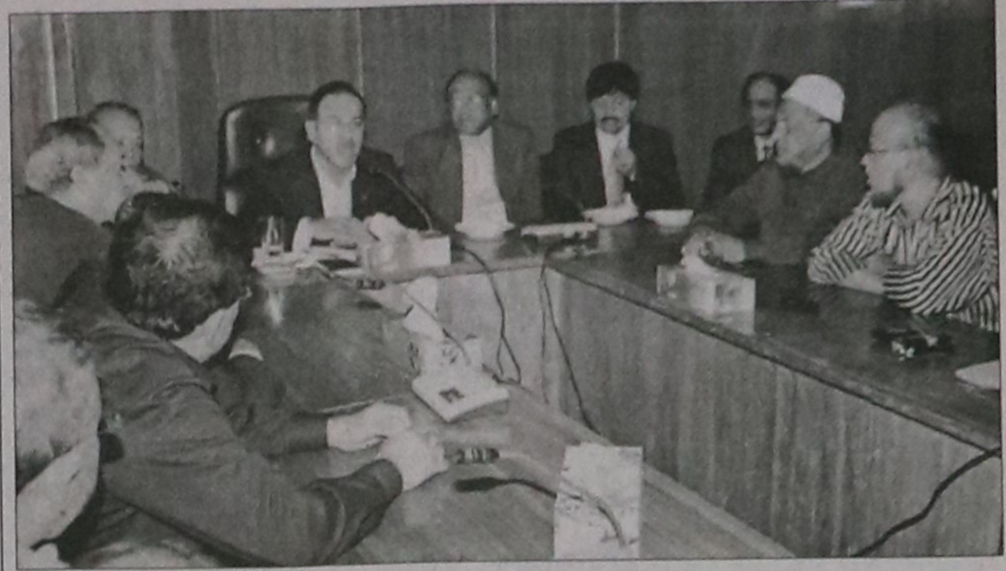
Commerce Minister Faruk Khan speaks to a delegation of shop owners at his office in Dhaka yesterday. (Story on B1)