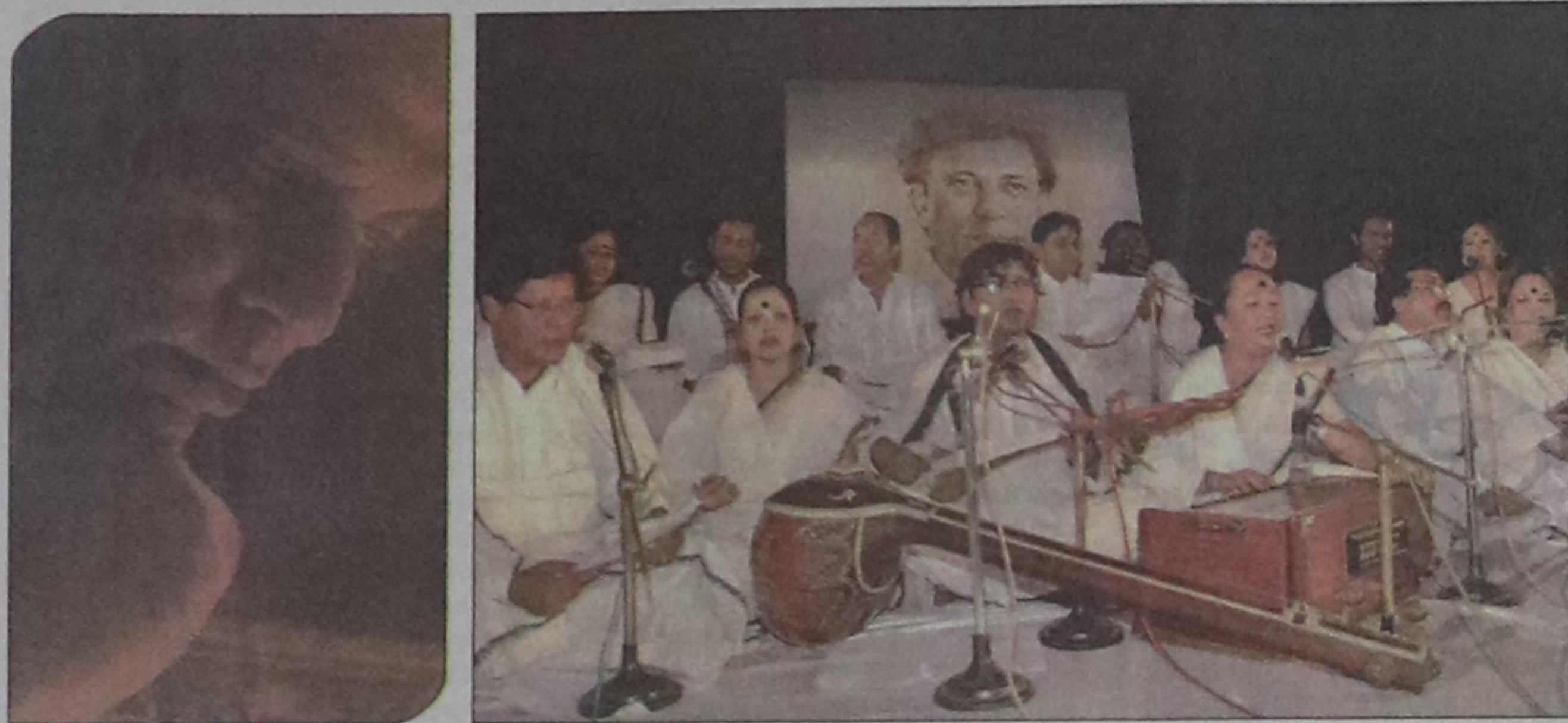
The video screened at BSA featured clips of Dhaka Theatre's memorial musical programme (right) for Selim Al Deen, held last year.