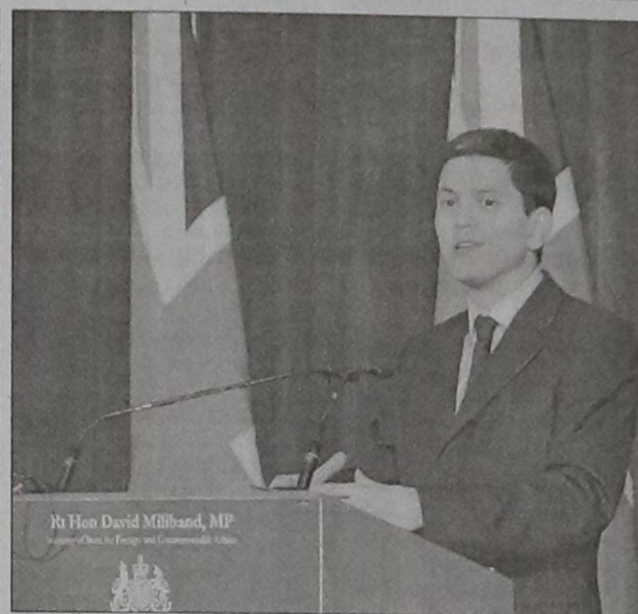
British Foreign Minister David Miliband speaks at a press conference in Mumbai yesterday. Miliband called on Pakistan to show "zero tolerance" towards militant groups based in the country that have been blamed for the Mumbai terror attacks.

"We're going to do everything in our power to make sure that they cannot create safe havens that can attack Americans."