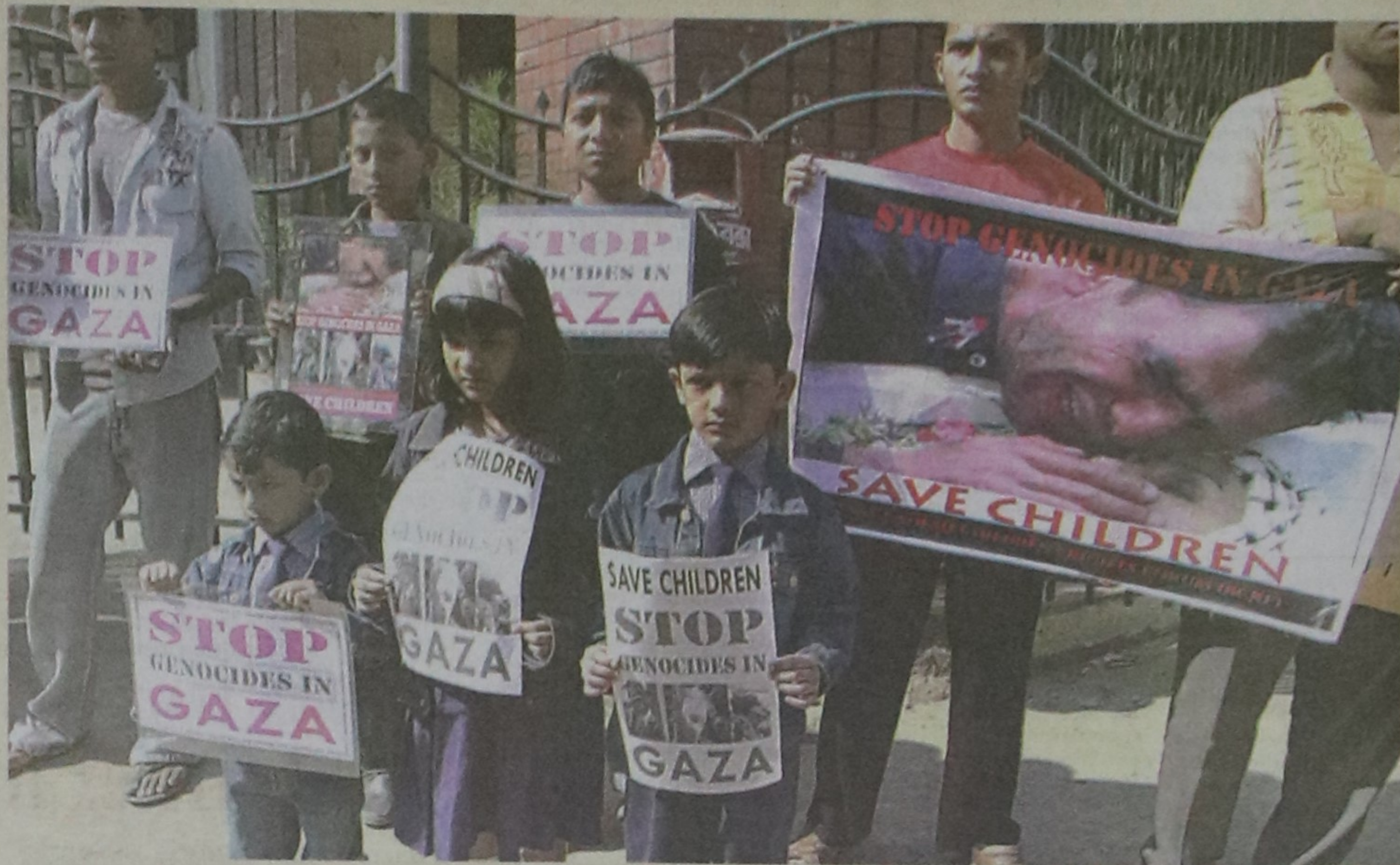
Children form a human chain in front of Chittagong Press Club demanding an end to Israeli air strike on Gaza where a large number of children were killed. Bangladesh Children's Rights Forum organised the human chain on Tuesday.