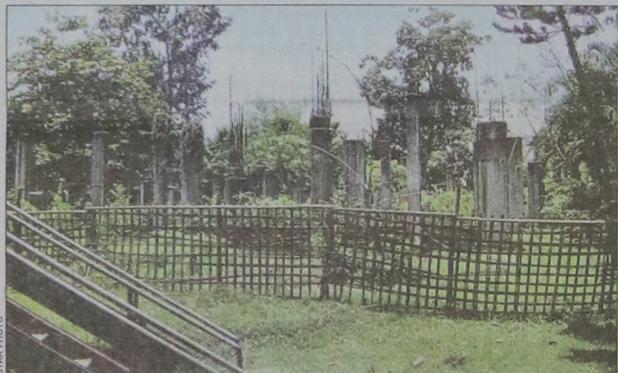
Nursery at Rangamati Pura Park.

He said though the fire incidents have reduced to a some extent while the casualty came down to a large scale. He said they are also emphasising on standard electrification and fire drill for the workers at least for once a month to avert casualty.