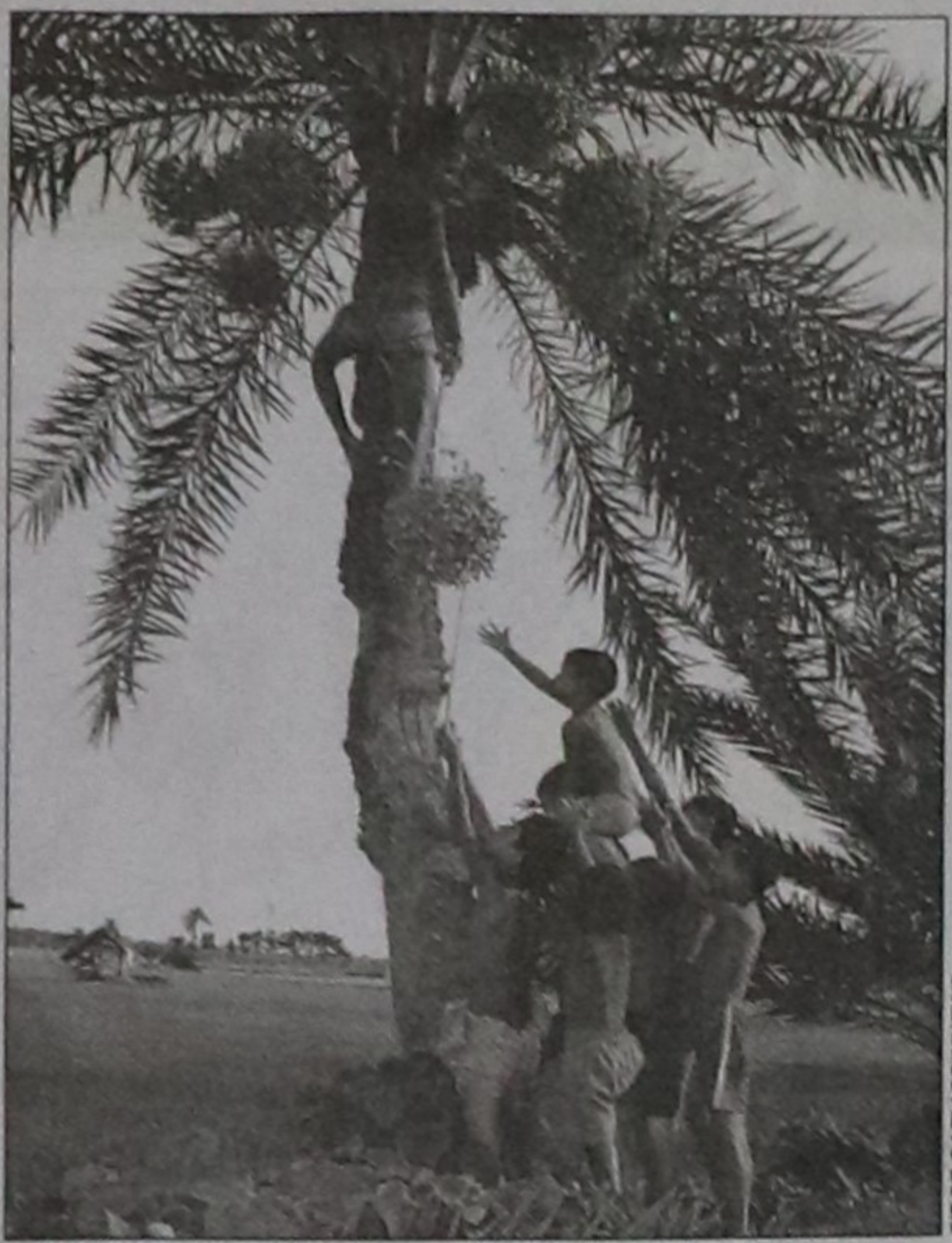
FRIZO GAZI / DRINKNEWS

Letters will only be considered if they carry the writer's full name, address and telephone number (if any). The identity of the writers will be protected. Letters must be limited to 300 words. All letters will be subject to editing.