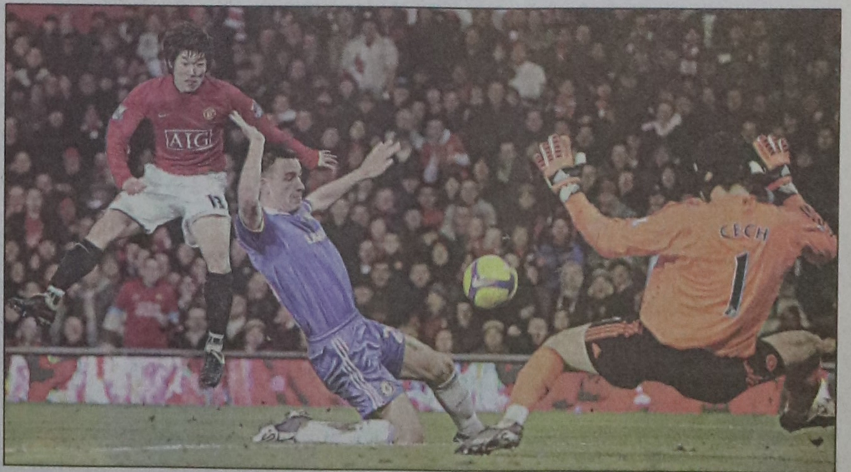
Manchester United midfielder Park Ji-Sung's (L) shot is blocked by Chelsea defender John Terry (C) during their Premier League match at Old Trafford on Sunday.