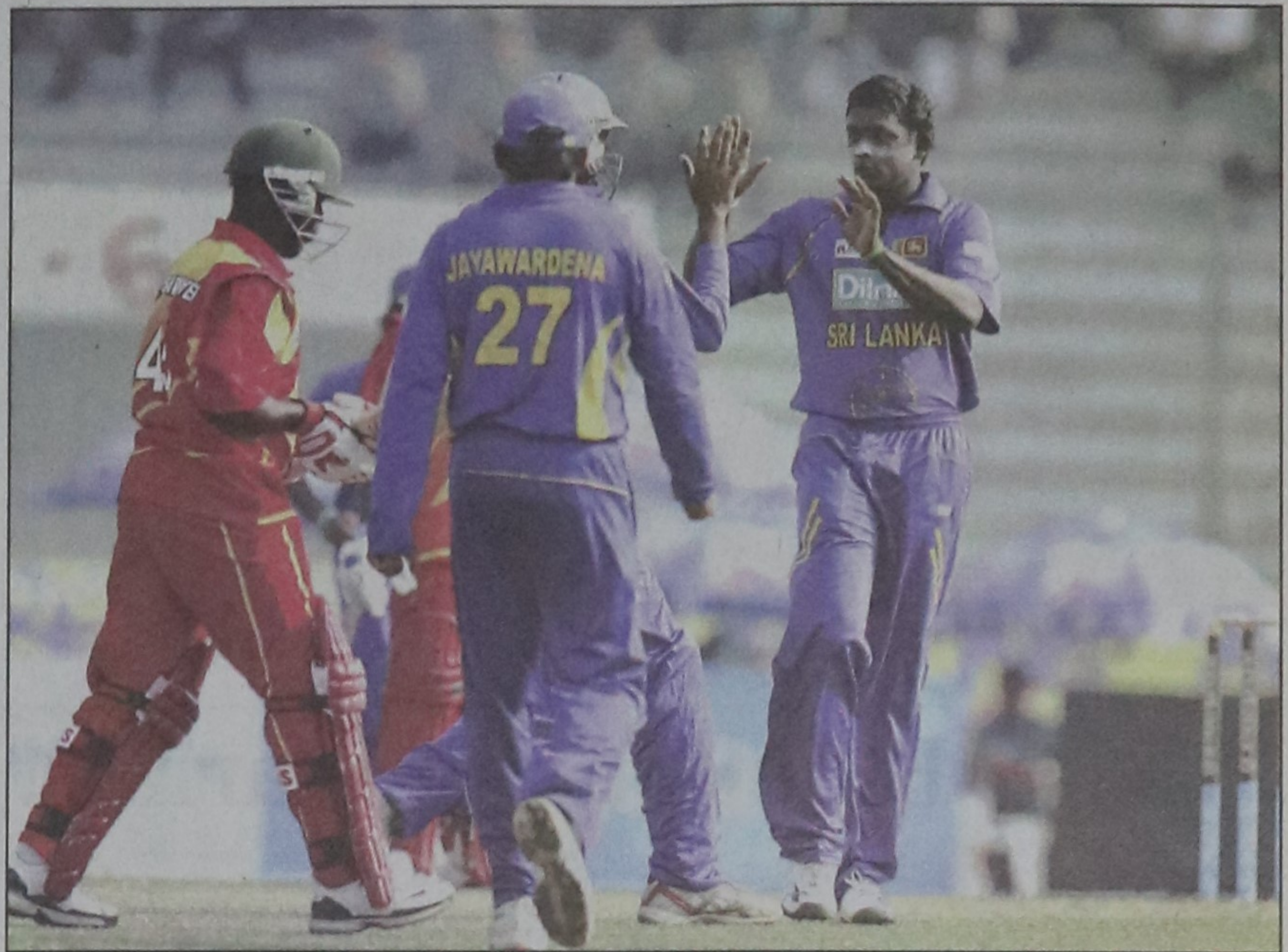
Sri Lanka spinner Ajantha Mendis (R) celebrates bowling Zimbabwe batsman Stuart Matsikenyeri during their Grameenphone tri-nation ODI at the Sher-e-Bangla National Stadium in Mirpur on Monday.