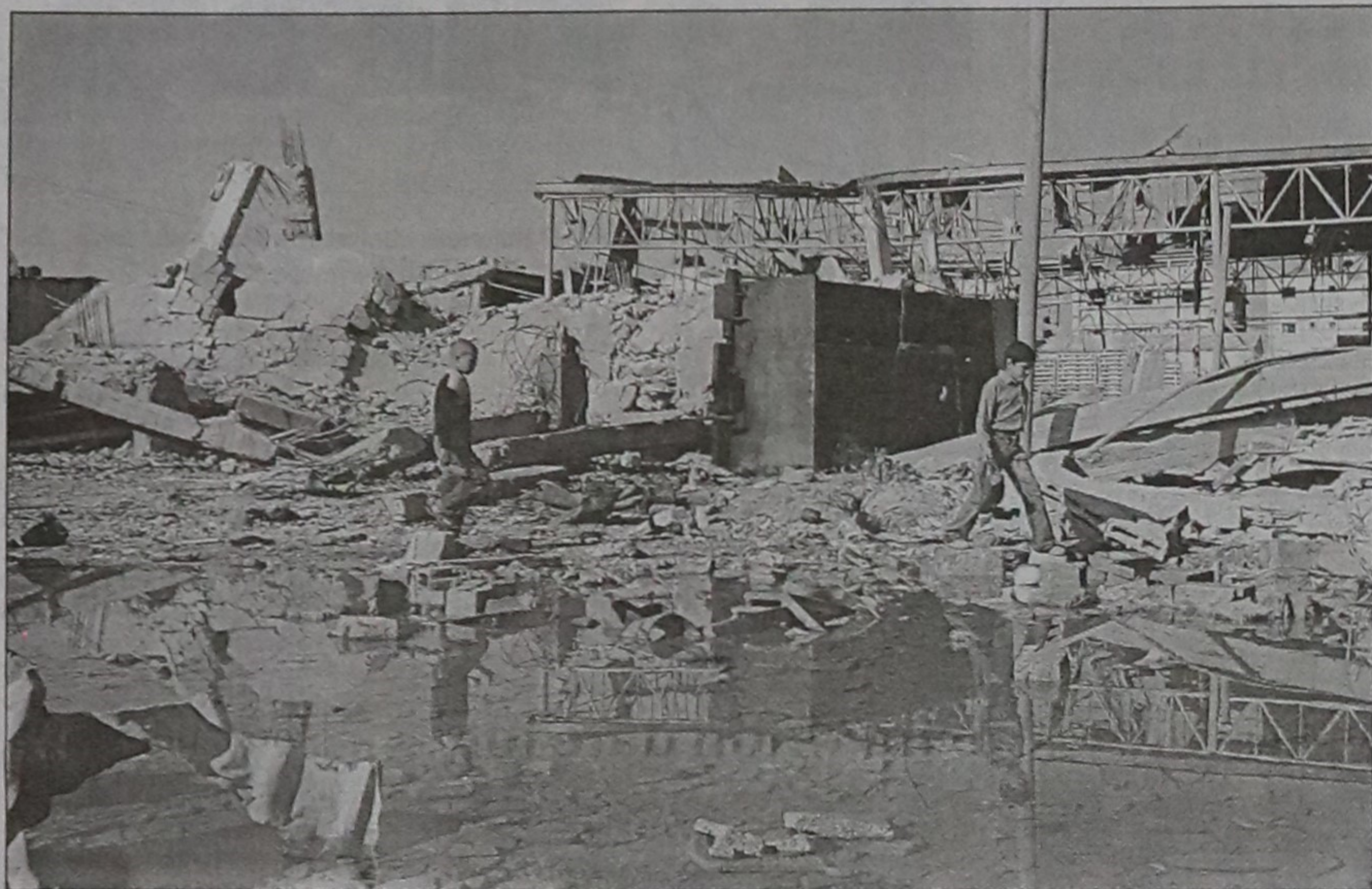
Palestinian boys walk past a destroyed building in al-Zeitun neighbourhood following Israeli strikes in Gaza City yesterday. Israeli troops battled Hamas fighters in Gaza into a third week Saturday as both sides ignored a UN Security Council demand to end the fighting that has killed more than 800 people.