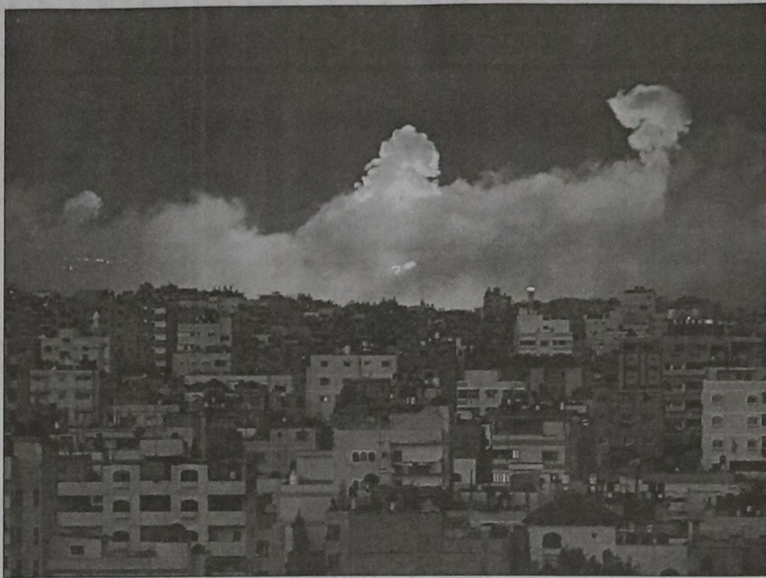
A picture shows smoke and fire from Israeli artillery shells over the Gaza Strip town of Jabalia on Friday as seen from Gaza City. Israel vowed to keep up its offensive in the Gaza Strip despite a UN resolution calling for an immediate ceasefire.

However, Hamas later rejected that resolution, and Israel followed by rejecting a ceasefire.