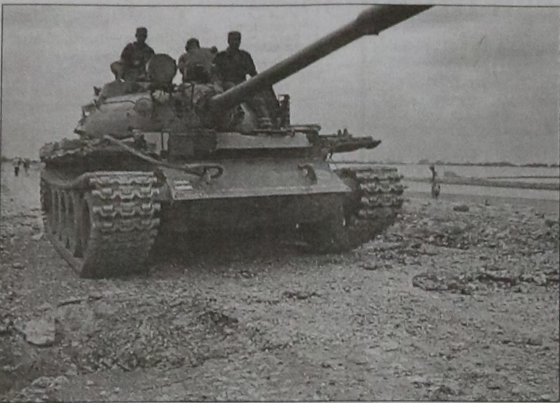
Sri Lankan Defence Ministry photo shows troops in the Elephant Pass area following its capture yesterday. Lankan forces were ready to deal a "decisive blow" to the remaining Tamil Tiger positions following the capture of the highly strategic pass.