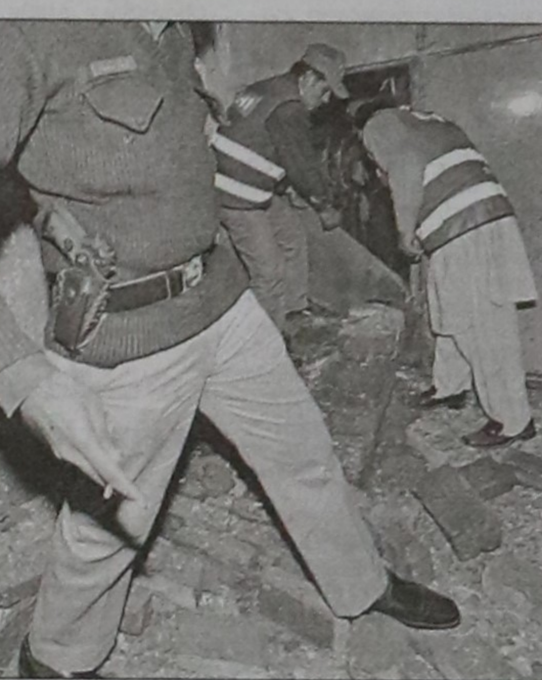
A Pakistani police officer inspects the site of a bomb explosion outside a theatre in Lahore on Friday. Four low-grade bombs exploded at a popular theatre complex in the eastern Pakistani city causing minor damage to nearby buildings but no casualties.

He avoided questions on the Pakistan Peoples Party (PPP) government's handling of the crisis after the Mumbai attacks that India has blamed on Pakistani elements. He would not comment on the performance of the government and neither would he compare it with his government.