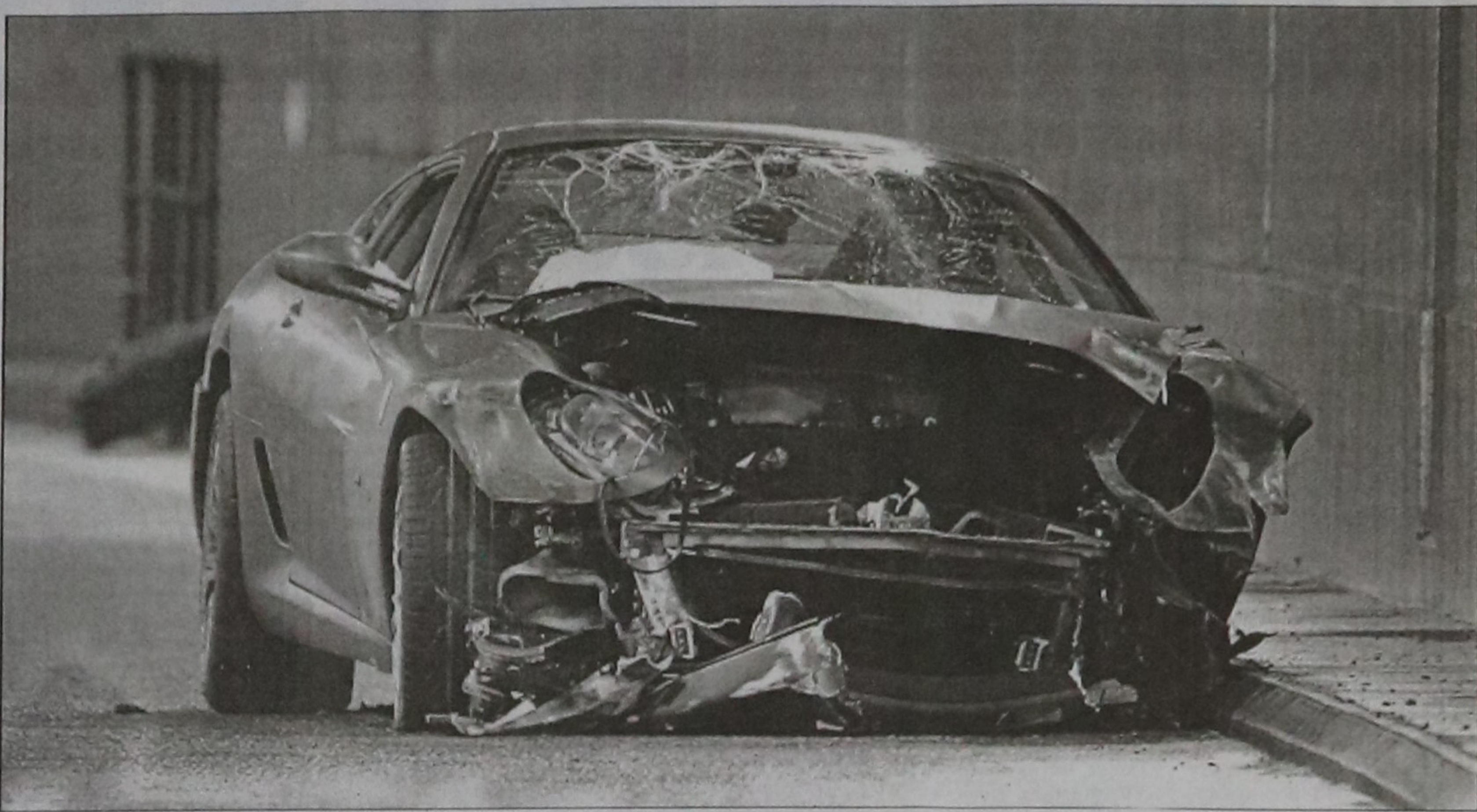
Manchester United star Cristiano Ronaldo's crashed Ferrari is pictured in a tunnel near Manchester Airport on Thursday. Ronaldo escaped unhurt from the car crash that left his Ferrari a mangled wreck and will be fit to play in Sunday's Premier League showdown with Chelsea.

Barring any delayed reaction to the crash, he will be back in the starting line-up for Sunday's match at Old Trafford as United seek to overcome one of their major rivals in the battle to retain the Premier League trophy.